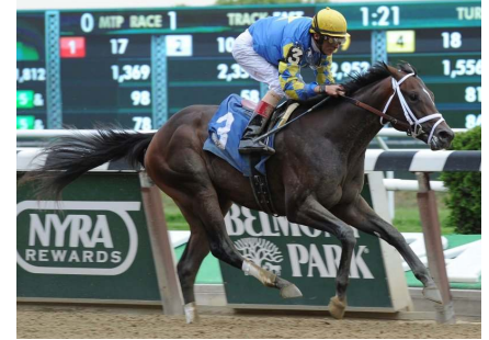
Uncle Vinny