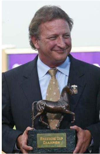
Eugene Melnyk

Long-time Thoroughbred owner and breeder Eugene Melnyk, who also owns the Ottawa Senators hockey team, is in stable condition after a successful liver transplant Tuesday, according to the University Health Network's website. The donor, who wishes to remain anonymous, is also doing well.