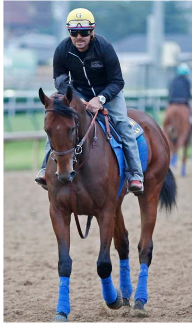
American Pharoah jogging at Churchill Thursday morning.