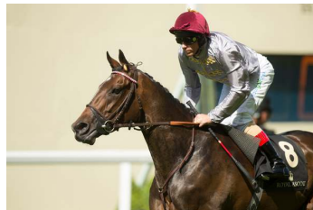
Treve Racing Post