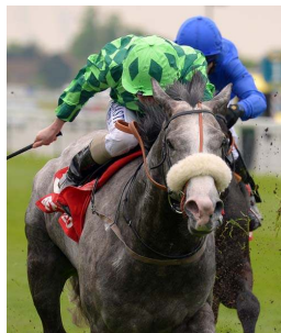
The Grey Gatsby