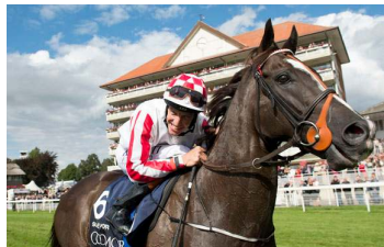
Sole Power Racing Post