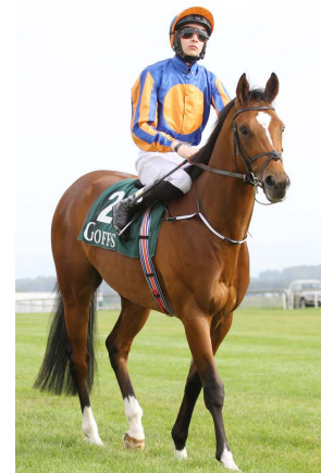
Gleneagles