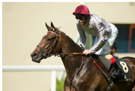
Treve Racing Post

Al Shaqab Racing's dual G1 Prix de l'Arc de Triomphe heroine Treve (Fr) (Motivator {GB}) is "spot on" ahead of her return to action next week. Criquelette