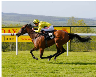
Lady of Dubai Racing Post

Last seen finishing runner-up to the subsequently Classic-placed Irish Rookie (Ire) (Azamour {Ire}) in Newmarket's Listed Montrose Fillies' S. over a mile in November, Lady of Dubai returned to justify favoritism and book a passage to the June 5 G1 Epsom Oaks. With Toujours l'Amour (GB) (Authorized {Ire}) having advertised the form of the Montrose when winning the Listed Lingfield Oaks Trial having been fifth in that end-of-