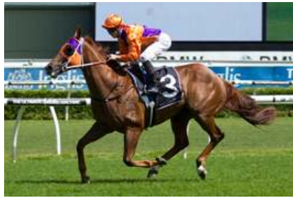
Our Boy Malachi Racing and Sports

A full field of 16 plus one also eligible line up for the G1 Doomben 10,000 in Queensland, Australia Saturday led by current favorite--the 5-1 Ciaron Maher-trained Srikandi (Aus) (Dubawi {Ire}). The chestnut filly displaced one-time market leader Our Boy Malachi (Aus) (Top Echelon {Aus}), trained by Team Hawkes, in the betting after drawing an ideal position in barrier five, while the latter has been hung out to dry in post 12. Third in last year's G1 Stradbroke H. in June, Srikandi landed the G2 Victory S. at the Gold Cost Apr. 25, but