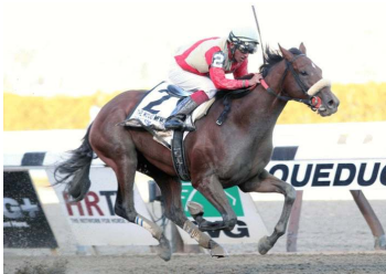
Wicked Strong