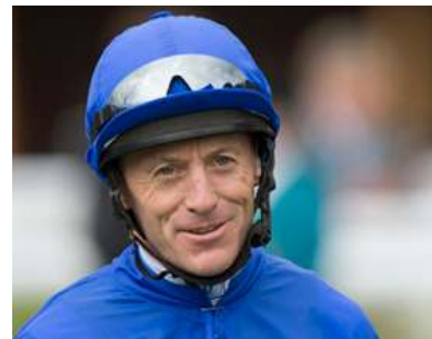
Kieren Fallon