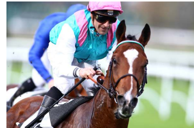
Epicuris Scoop Dyga