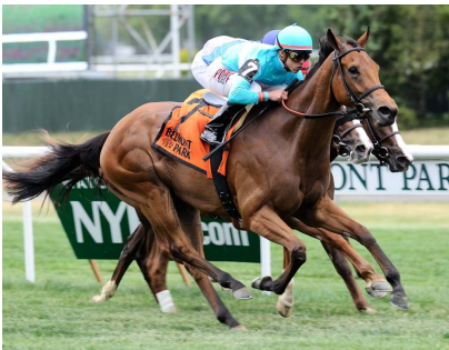
Lady Eli