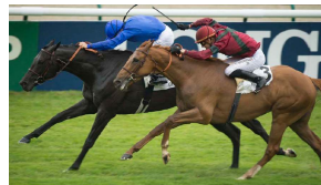
Manatee