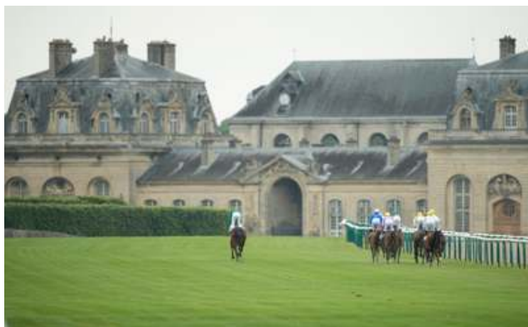
Kataniya races solo on the outside down the Chantilly backstretch