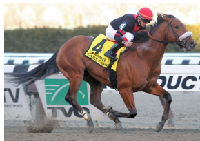
Dads Caps

Belmont Stakes weekend kicks off Friday in New York, with a pair of graded stakes races. The GII True North S. attracted a field of eight, led by two-time GI Carter H. winner Dads Caps (Discreet Cat). A field of nine fillies and mares, headed by three-time Grade I winner Stephanie's Kitten (Kitten's Joy), will go postward in the GII New York S.