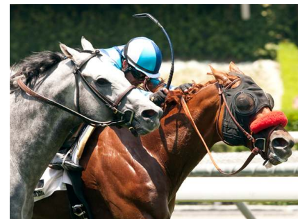
Oliver's Tale (inside)

Oliver's Tale earned his first stakes victory and confirmed his affinity for this down-the-hill trip Sunday afternoon in Arcadia. Winner of a course-and-distance allowance event in April 2014, he was sent to the sidelines for an extended break following a fifth-place finish over a grassy mile here in June of last term. The chestnut returned a winner, leading wire-to-wire over this same local trip Mar. 20, and was tabbed as the