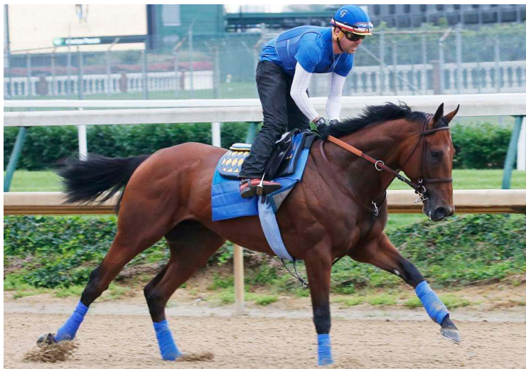
American Pharoah gallops at Churchill Sunday.