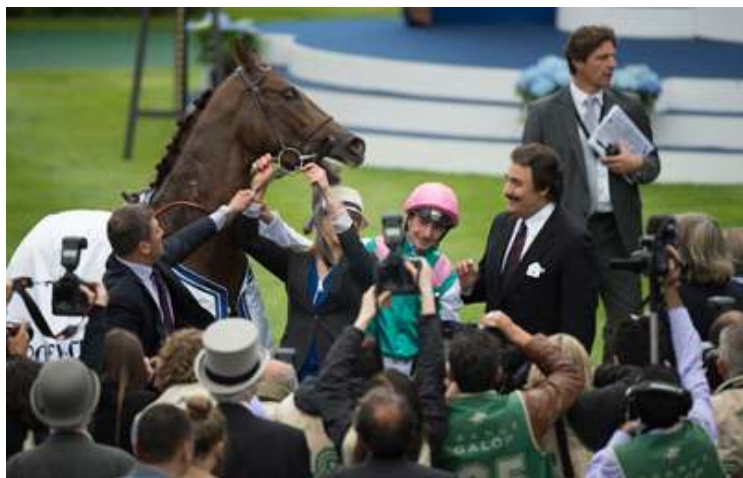
New Bay with energy to spare after winning the Prix du Jockey Club Racing Post