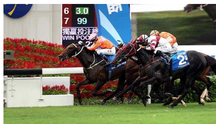
Helene Super Star takes a five-way photo

The 2013 G2 UAE Derby hero, the former Lines of Battle failed to make the Hong Kong Derby in 2014--the race for which he was ostensibly purchased--and