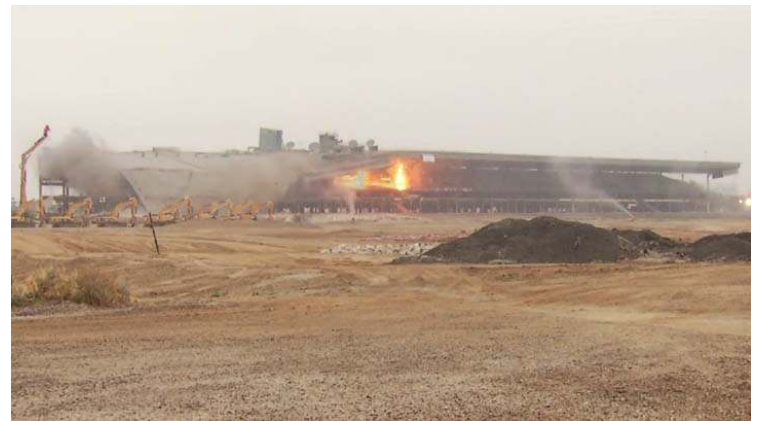
KTLA reports on demolition of Hollywood Park grandstand