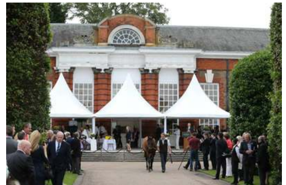
Last year's London Sale at The Orangery Goffs

Last year's inaugural Goffs London Sale was a pioneering event, and thus some logistical strings had to be pulled to ensure buyers of horses with Ascot entries could run their purchases in their colors that week, some as soon as the following day. Goffs put in place an