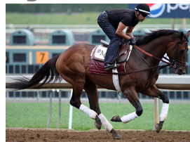
Firing Line