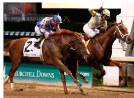
Noble Bird holds off Lea Reed Palmer