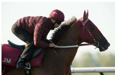
Hong Kong raider Able Friend