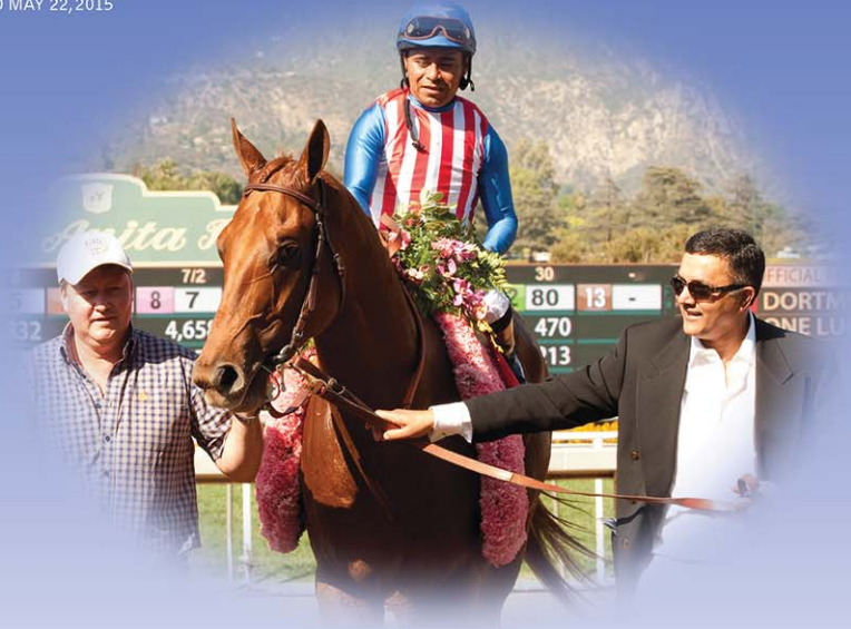
2013 SELECTED GRAD DORTMUND

INCLUDING G1/G2 STAKES HORSES IN 2015 ALONE – AMERICAN PHAROAH • BIRDTATTHEWIRE • CALLBACK CONSTITUTION • DORTMUND • FIRING LINE • FRAMMENTO ITSAKNOCKOUT • ROSALIND • SKY TREASURE • STELLAR WIND TALE OF VERVE • TEPIN • TONALIST