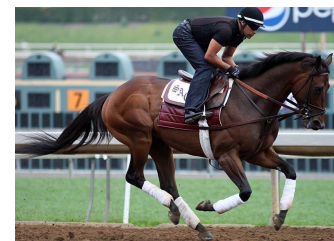
Firing Line