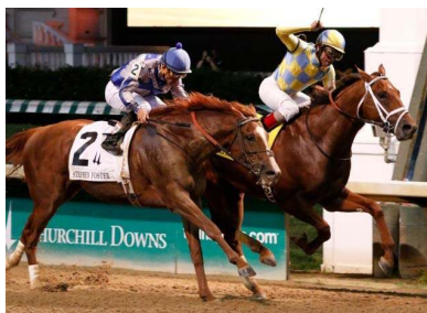
Noble Bird holds off Lea Reed Palmer