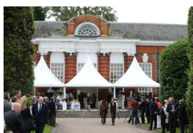
Last year's London Sale Goffs