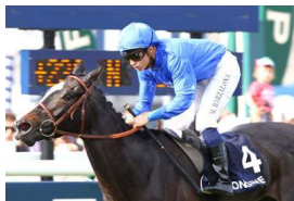
Fintry

Godolphin homebred Fintry (Ire) (Shamardal) led home a one-two-three for the fairer sex in Sunday's G3 Prix Bertrand du Breuil Longines. "She's a lovely filly and you can't fault her," winning trainer Andre Fabre said. "She has a lot of heart and loves that good ground."