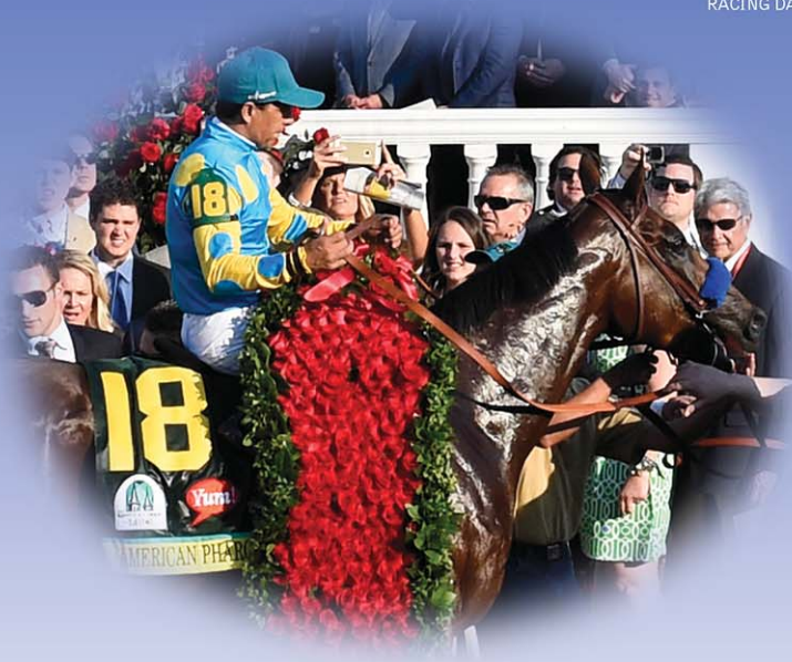
2013 SELECTED GRAD AMERICAN PHAROAH

BLOOD-HORSE MARKETWATCH RACING DATA UP TO MAY 22, 2015