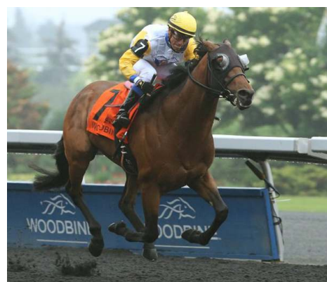
Danish Dynaformer

Danish Dynaformer continued his march toward a bid at the Queen's Plate S. with a resounding triumph in