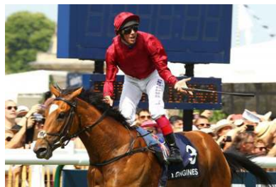
Star of Seville