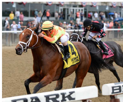
Dame Dorothy turns back Street Story