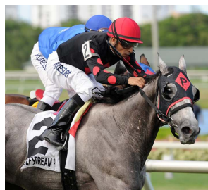
My Point Exactly

My Point Exactly graduated by 10 1/2 lengths at third asking on the dirt at Gulfstream last August and captured the Sunday Silence S. when returning to the turf at Louisiana Downs a month later. Seventh to 'TDN Rising Star' Materiality (Afleet Alex) in the GI Florida Derby Mar. 28, the gray was third in this venue's Tarpon S. on the main track Apr. 25 and was fifth in the Gill Penn Mile on the sod May 30. Dueling for second off respectable early splits, My Point Exactly was hot on the leaders heels turning for home and