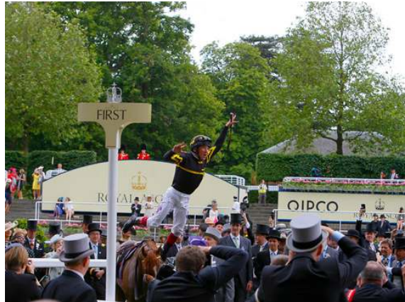
Frankie Dettori is sky high after riding Undrafted to win the Diamond Jubilee Racing Post