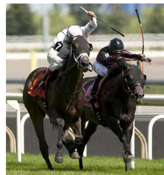
Hollywood Hideaway (inside) battles Beliveau to the wire.

Hollywood Hideaway crossed the wire second in this career debut, but was promoted to first after being impeded by Beliveau in deep stretch. A bit overlooked by the bettors despite his precocious and grassy pedigree and a consistent local worktab, the grey broke out at the start, but was quickly corrected to dictate the pace through a quarter-mile in :23.23. Still well in hand turning for home, the first timer was put in tight quarters when Beliveau challenged for the lead and shifted inward. Hollywood Hideaway lacked sufficient running room to re-establish command in the final furlong and crossed the wire a head's length behind that rival, but was promoted to first after a jockey's claim of foul.