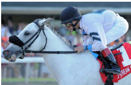
Mr. Jordan

'TDN Rising Star' Mr. Jordan (Kantharos) headlines a field of eight in Sunday's GIII Pegasus S. at Monmouth Park as he makes his first start since being disqualified from first to second in Gulfstream's Tarpon S. Apr. 25.