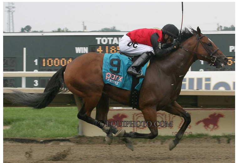
A.P. Indian Equi-Photo