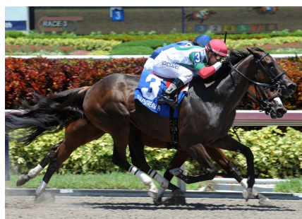
Little Alexis