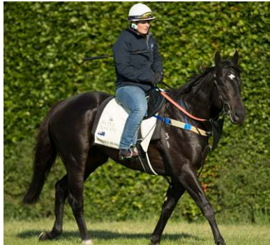
Brazen Beau pictured at Newmarket Racing Post

Next month's G1 July Cup at Newmarket could have a strong international line-up with a distinct possibility of the Australian-trained Brazen Beau (Aus) (I Am Invincible {Aus}) again going head-to-head with Undrafted (Purim), his conqueror in last week's G1 Diamond Jubilee S. at Royal Ascot. Chris Waller's runner ploughed a lone furrow up the Ascot straight with none of the other riders keen to follow Craig Williams, a move that many felt lead to his defeat. Brazen Beau ran in the colours of On Track Racing at Ascot, but if lining up at Newmarket, he will probably be donning the Godolphin blue. Sheikh Mohammed bought into the horse before Ascot. Explaining the current ownership structure of the horse Henry Plumptre, Godolphin's representative in Australia, explained, "The relationship with On Track was very relaxed, they leased the horse back until the end of June, which gave them the opportunity of going to Ascot. We also agreed that if Sheikh Mohammed was to have the pleasure of watching the horse run in his colours, it should be in the July Cup.