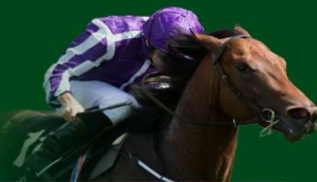
WATERLOO BRIDGE (IRE)

Coventry Stakes Gr.2 BURATINO (IRE) AIR FORCE BLUE ELTEZAM (IRE)