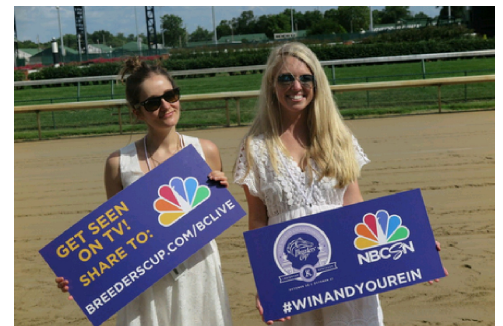
Promoting UGC for the Stephen Foster

In its simplest explanation, Burst allows a broadcaster to receive and sort through a massive number of real-time, fan-generated video streams. As the company's website explains, Burst expands traditional broadcast coverage "to unlimited perspectives from an army of smart phones," culling them for both compelling content and technical quality to select clips that are best suited for broadcast.