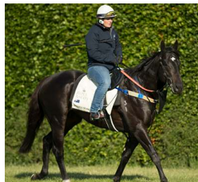
Brazen Beau

The G1 July Cup could feature a rematch of last week's G1 Diamond Jubilee S. one-two, with both Undrafted (Purim) and runner-up Brazen Beau (Aus) (I Am Invincible {Aus}) likely for the Newmarket race. Should he go postward in the event, Brazen Beau will likely be making his first start in Godolphin blue. Undrafted, meanwhile, was fourth in last year's July Cup.