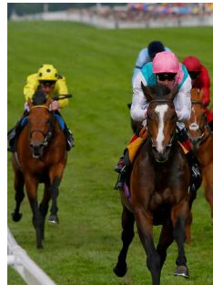
Snow Sky Racing Post

The G1 King George VI and Queen Elizabeth S. will be worth £1.15 million when it is run July 25. The purse increase looks likely to attract a competitive field, with possibles including Postponed (Ire) (Dubawi {Ire}) and Snow Sky (GB) (Nayef). Snow Sky, winner of the G2 Hardwicke S. last week, would have to be supplemented to the race.