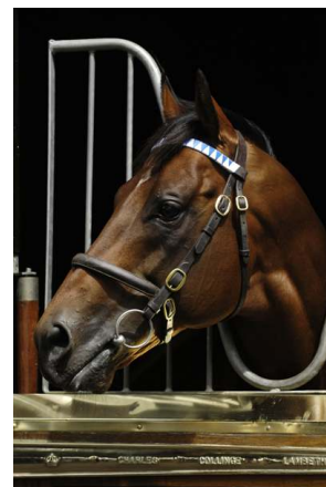
Sire of the top lot, Exceed And Excel