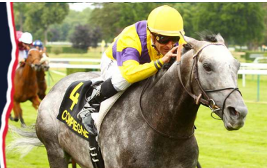
SIMBA (Fr) - Grand Prix de Compiègne (Listed)

France, Where racing make sense! f t www.frbc.fr