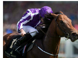
Waterloo Bridge

Oasis Dream, in turn, had to share the limelight with a couple of his companions at Banstead Manor Stud. It was Champs Elysees, a three-time Grade I winner in North America, who was responsible for G1 Gold Cup winner Trip To Paris. Cont. p3