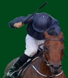
WASHINGTON DC (IRE)

Windsor Castle Stakes LR WASHINGTON DC (IRE) AREEN (IRE)