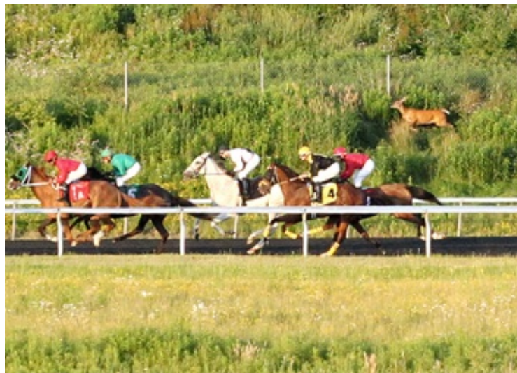
A deer keeps pace with the field during the last race at Presque Isle Downs Thursday evening, before moving onto the main track, bearing out circling the far turn and finishing off the board. Presque Isle had to cancel their June 22 card after the third race, when a large herd congregated on the track.