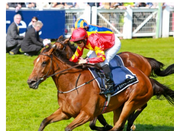
Epsom Oaks winner Qualify