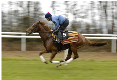
New Approach training at Coolcullen

Reflecting on the Galileo factor, Bolger said, "I was lucky to support him from an early stage in his career and, thankfully, it worked out. Teofilo was the first big breeding success I had. Both himself and [G1 Irish Derby winner] Soldier Of Fortune, who I sold to John Magnier, were reared here together in the same paddock."