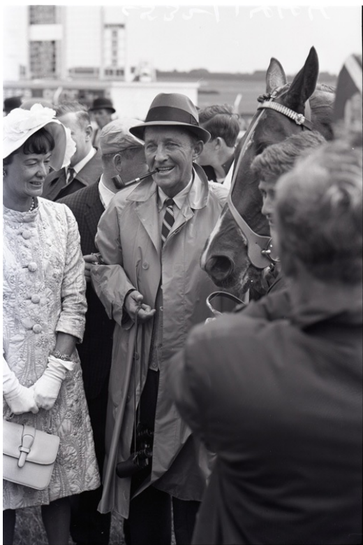
Bing Crosby with his Irish Derby winner Meadow Court in 1965