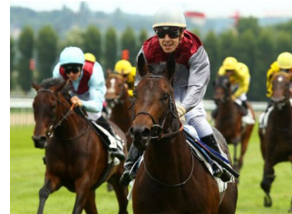
Money Maker

Money Maker recovered from a tardy start to occupy a prominent berth after the initial strides of this black-type dash restricted to newcomers. Nudged along to seize outright control with 300 meters remaining, he was soon pushed clear and kept on strongly under urging to maintain his advantage before gearing down in the closing stages to easily hold odds-on pick Kotama. Cont. p9