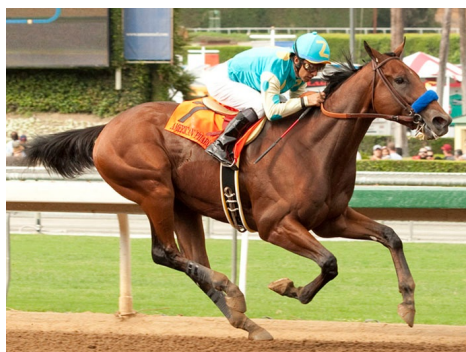
American Pharoah

The Zayat homebred, who was winning his seventh consecutive race when besting Frosted (Tapit) to secure the Triple Crown in the GI Belmont S. June 6, is one of