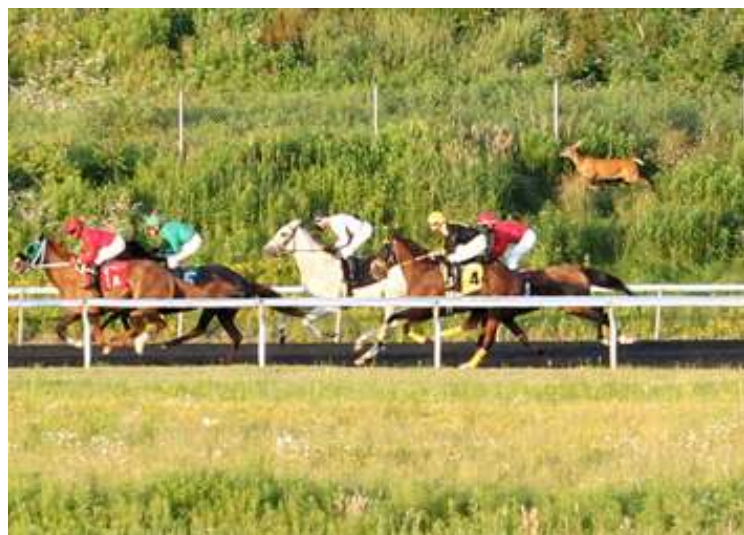
A deer keeps pace with the field during the last race at Presque Isle Downs Thursday evening, before moving onto the main track, bearing out circling the far turn and finishing off the board. Presque Isle had to cancel their June 22 card after the third race, when a large herd congregated on the track.