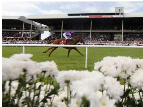
Australia winning last year's Irish Derby

The G1 Irish Derby, which sees its 150th renewal take place Saturday at The Curragh, will enjoy a purse boost to €1.5 million next year, with Dubai Duty Free extending its sponsorship a further two years. The agreement also gives Dubai Duty Free the option to extend their sponsor to 2020 at the end of the current contract. Dubai Duty Free has been the title sponsor of