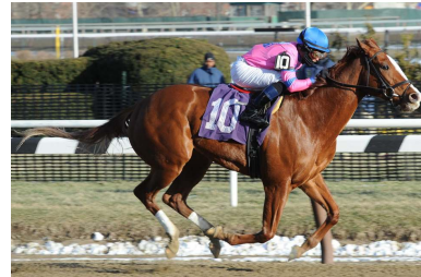
Hot City Girl

When asked how Hot City Girl compares with the rest of her Rice-trained family, the New York-based trainer said, “She seems to be getting better with age