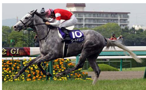
Gold Ship goes for a third-straight Takarazuka Kinen | JRA

Gold Ship (Jpn) (Stay Gold {Jpn}) goes for his third straight win in the race, and if he achieves the hat trick, he will become not only the first horse to win the Takarazuka three times, but the first to win any JRA Group 1 in three consecutive years. The fiery 6-year-old's age does not appear to be wearing on him, either; he won the G2 Hanshin Daishoten first-up this year