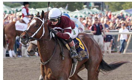
Untapable

Parx Racing and the Pennsylvania Thoroughbred Horsemen’s Association (PTHA) have joined forces to create the $20-Million Parx Racing Fall Festival from Aug. 29-Oct. 20, the organizations announced Friday. The purse level at the Bensalem oval will be doubled for the meet duration of 32 live race days, with the aim of increasing field size, enhancing betting interest and drawing new fans to the racetrack.