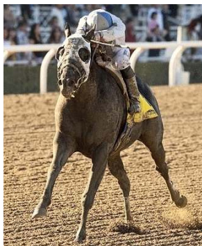
Sahara Sky