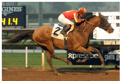
Hoppportunity