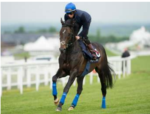
Irish Derby favorite Jack Hobbs

Second only to his peerless stable companion Golden Horn (GB) (Cape Cross {Ire}) so far, Godolphin's color-bearer Jack Hobbs (GB) (Halling) gets his chance to shine away from that barnmate in Saturday's 150th