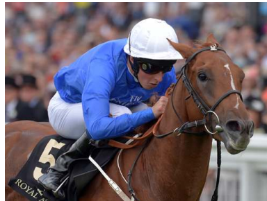
Buratino | Racing Post