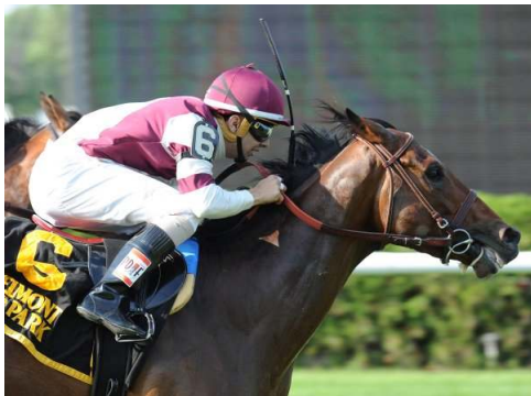
Divisadero co-headlines Belmont Derby