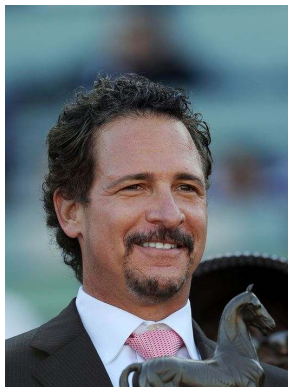
Jim Rome

Jim Rome, a prominent Thoroughbred owner and the host of "The Jim Rome Show" on CBS Sports Radio and "Jim Rome On Showtime," will deliver the keynote address when OwnerView, The Jockey Club, and the Thoroughbred Owners and Breeders Association host the second Thoroughbred Owner Conference in Hallandale Beach, Florida, in January 2016. The conference will be held at Gulfstream Park from January 11-14 during the week leading up to the 45th Annual Eclipse Awards Dinner, which is scheduled for Saturday, Jan. 16. Rome has recently enjoyed success campaigning horses under the name of his Jungle