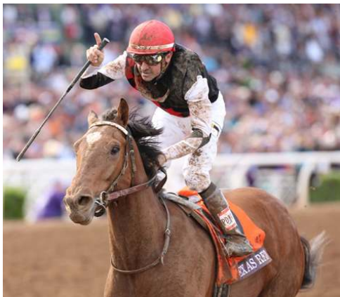
Texas Red invades for Dwyer