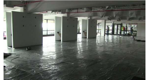
Simulcast facility at The Red Mile