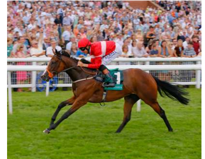
Tiggy Wiggy | Racing Post

Richard Hannon has decided to give two of his high-profile horses a mid-season break following their recent disappointing efforts. Tiggy Wiggy (Ire) (Kodiak {GB}) made a bright start to the season when third in the G1 1000 Guineas at Newmarket but failed to build on that when well-beaten in the G1 Commonwealth Cup at Royal Ascot, and her trainer feels some down time is now required. "I think the ground was probably a little bit quick for Tiggy Wiggy. We scoped her when she came back and there was nothing wrong with her. She was a very good 2-year-old and had a fair bit of racing and I would say she just had a hard race in the Classic." Her stablemate Ivawood (Ire) (Zebedee {GB}) was also third in his Classic, the G1 2000 Guineas, before disappointing in the G3 Jersey S. and, according to Hannon, is also set for a break from the races. Despite his recent reversal Hannon maintains faith in the handsome 3-year-old and has his eye on some lofty late season targets. "Ivawood is having a break, too," Hannon confirmed. "There's lot of nice races for him, including some in France. Physically he couldn't look any better and I have a feeling he'll come back towards the end of the year and then we might look at something like the Breeders' Cup."