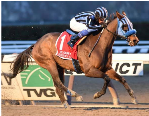
It's no secret where Private Zone will be in the Belmont Sprint Championship