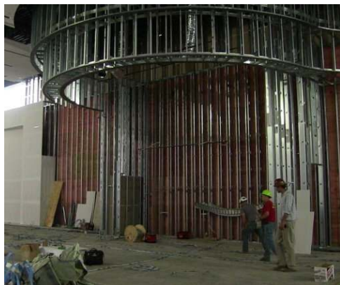
Centerpiece bar in the Grand Hall

Keeneland is currently planning on a full slate of events at The Red Mile for this fall's Breeders' Cup World Championships Oct. 30-31. The TDN will revisit The Red Mile when the historical racing facility is up and running and detail all the festivities.