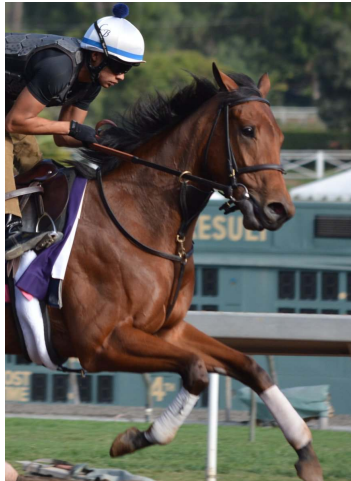
Lady Eli | Sherackatthetrack