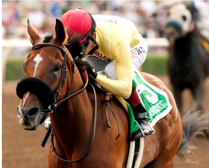
Masochistic