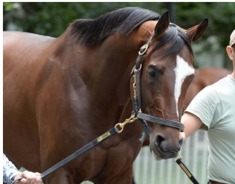
Tonalist faces five in Suburban