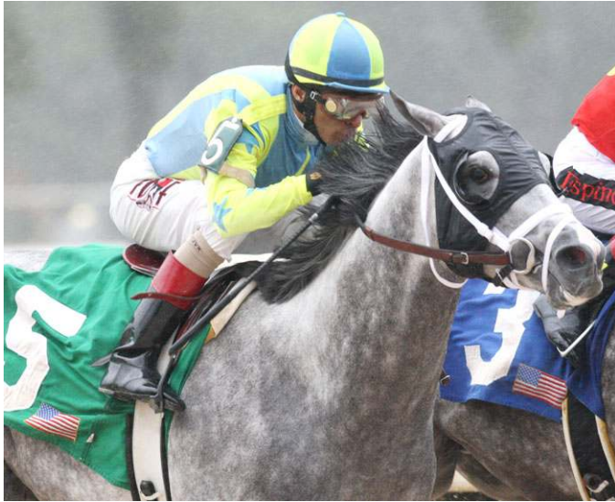
Gili Oaklawn H. hero Race Day returns in Sunday's Gili Salvator Mile at Monmouth Park. Field p4