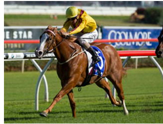
Miracles Of Life | Racing & Sports