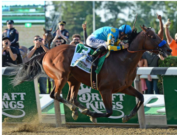
American Pharoah