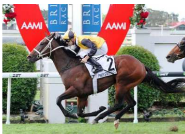
Press Statement | Vinery Stud