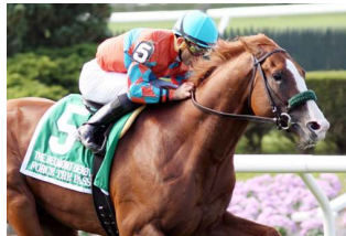
Force the Pass