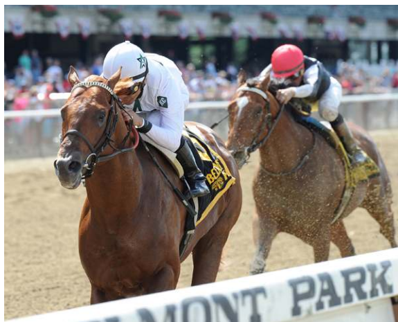
Speightster shakes free from Texas Red