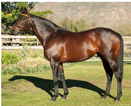
Champion sire Silvano sired the top three in the Durban July | Maine Chance Farm

In what seemed like a flashback to this day last year, when Wylie Hall (Aus) (Redoute's Choice {Aus}) was disqualified from the win in the G1 Durban July after interfering with Legislate (SAf) (Dynasty {SAf}) in the lane, Power King had to survive an inquiry but this year the fortunes played in the favor of the first-past-the-post in South Africa's richest race. Sneaking into the July with the lowest weight in the field and largely dismissed by punters, Power King traveled midpack and off the fence through the opening stages of the 2200-meter event.