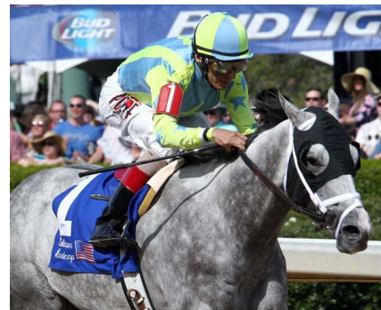
Race Day