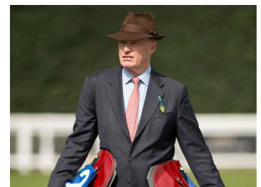
Trainer John Gosden won both group races at Sandown Saturday | Racing Post

Like his stable companion Western Hymn (GB) (High Chaparral {Ire}), Waady has a distinct liking for this track and delivered another of his late shows to extend his unbeaten record here and earn a first pattern-race success. The form of his third win from three visits to this venue had received a major boost after Profitable (Ire) (Invincible Spirit {Ire}), who had finished two lengths behind him in the June 13 Listed Scurry S., had run so well when fifth in Royal Ascot's G1 Commonwealth Cup, and his task was made seemingly easier with the withdrawal of the classy filly Mecca's Angel (Ire) (Dark Angel {Ire}) on account of the lively ground. Cont. p17