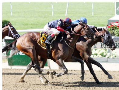
Effinex gets home first in the Suburban

Impressive in taking an open second-level allowance-with Coach Inge third-over a muddy Aqueduct inner track Mar. 27, Effinex defeated heavily favored Wicked Strong (Hard Spun) into third when a 3/4-length winner of the GIII Excelsior S. at the Big A Apr. 25, but had his equipment malfunction in the Brooklyn and walked under the wire as Coach Inge