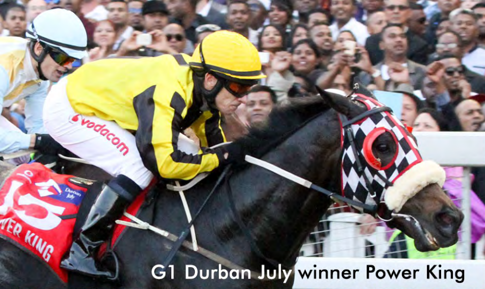
G1 Durban July winner Power King