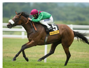
Euro Charline