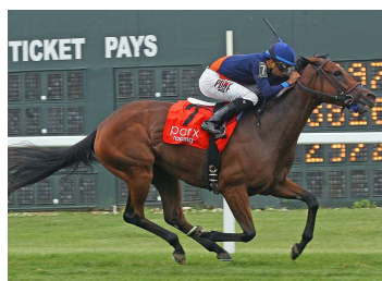
Coffee Clique

Coffee Clique returned to the sharp form she displayed last term with a victory in Saturday's GIII Dr. James Penney Memorial H. Tracking from fourth off moderate early splits, the heavy favorite launched a bid from off the inside to tackle the leaders turning for home. Gaining command in mid-stretch, the bay extended clear to secure her first win of the season.