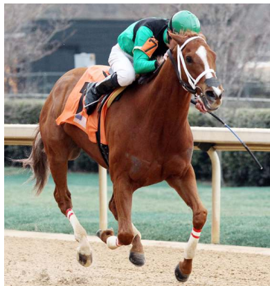
Work All Week

Champion sprinter Work All Week (City Zip) headlines a field of nine signed on for Sunday's GII Smile Sprint S. at Gulfstream Park. Last year's GI Breeders' Cup