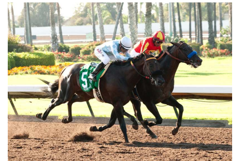
Gimme Da Lute (inside) fends off Prospect Park

Gimme Da Lute's dam produced a filly by Stormin Fever in 2013, a colt by Coil last year and a full sister to the winner this term.