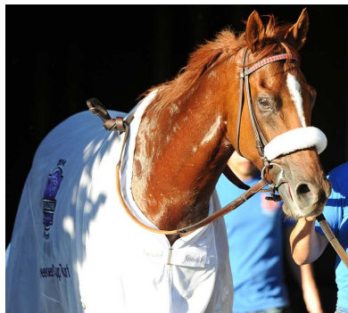
Main Sequence | A Coglianese