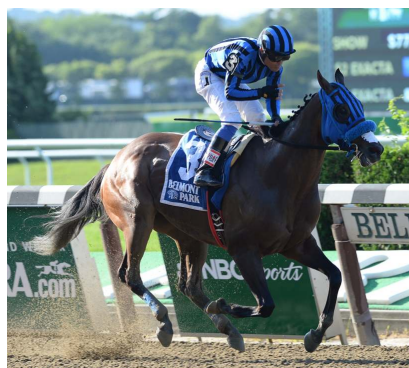
Private Zone