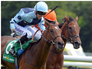
Lady Tiana | Racing Post