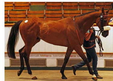
American Hope | Tattersalls

The common feature of the horses-in-training sales at Tattersalls in July and October is the diversity of destinations of the horses sold through the ring. The same was true for the middle session of the three-day auction, as broodmares gave way to form horses. A late flurry of activity just a handful of lots from the end of the day saw the Lemon Drop Kid gelding American Hope ( lot 552 ) snapped up by BBA Ireland's Michael