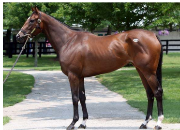
Temper Mint Patty