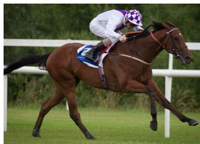
Sanus Per Aquam | Racing Post

Granted the ideal lead early by his rabbit Gleine (Ire) (Vocalised), the imposing homebred took command passing the quarter-pole and soon had his market rival, a half-brother to the 2009 G1 Deutsches Derby and G1 Rheinland-Pokal hero Wiener Walzer (Ger) (Dynaformer), in serious trouble. Pushed out to draw clear, the bay whose dam is a half to Dawn Approach (Ire) (New Approach {Ire}) finished strongly and had 4 3/4 lengths to spare at the line. Afterwards, there was