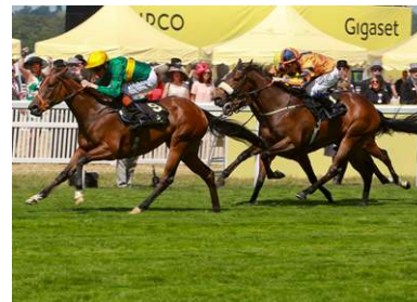
Illuminate | Racing Post