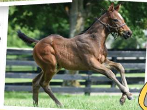
Queen's Reward colt at Nursery Place