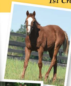
Comanche Star filly at Three Chimneys