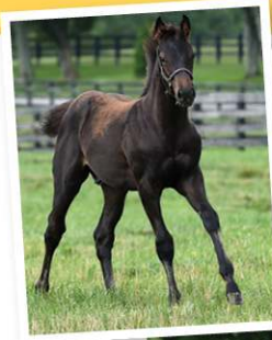
Stone Hope colt at Nursery Place

WINNER OF THE Kentucky Derby-G1 Florida Derby-G1 1st Crop Foals