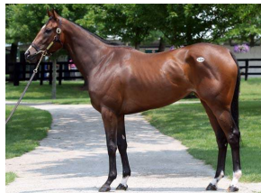
Temper Mint Patty