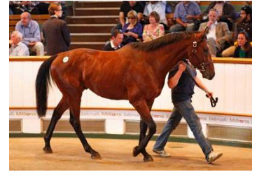
Grand Argentier