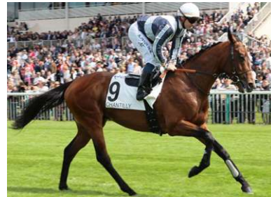
Karakontie