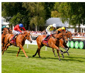
Big Orange | Racing Post