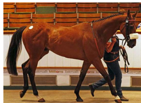
American Hope | Tattersalls