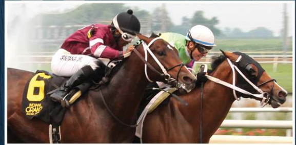
Two Juvenile colts by COWBOY CAL battle to a 1-2 finish. Winchell Stables homebred RANGE RIDER (outside) won the decision, a 5f MSW at Indiana Downs on 7/1.