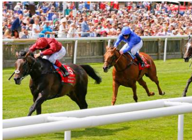
Mr Singh another for Dettori and Gosden

Mr Singh, who ran third at Kempton in his only juvenile start Dec. 10, opened his sophomore campaign with an April 18 Newbury maiden win before running fifth in the May 22 Listed Cocked Hat S. at Goodwood. Lady Bamford's homebred bay lined up for this July festival opener coming off a runner-up finish in the June 19 G2 King Edward VII S. at Royal Ascot and registered a career high under a canny Frankie Dettori. Leading after the initial strides, he was committed when pressed passing the three-furlong marker and was pushed out once taking a decisive advantage into the final eighth to comfortably best Future Empire. "He was the form horse in the race, it was