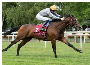
Shalaa | Racing Post

Al Shaqab Racing's Shalaa (Ire) (Invincible Spirit {Ire}) proved he is upwardly mobile in Thursday's G2 July S. The juvenile is now two for three after his one-length victory at Newmarket.