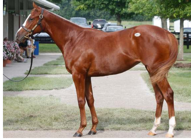
Hip 317