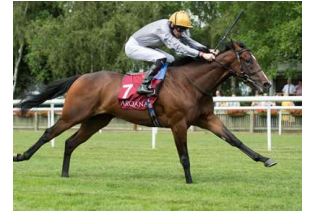
Shalaa at full stretch