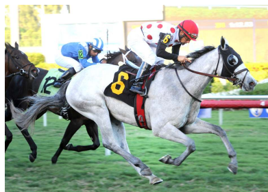
World Approval