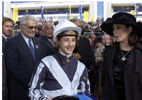
(L to R) Sharif, jockey Christophe Lemaire and French actress Isabelle Adjani after the 2003 Prix Marcel Boussac

Born in 1932 in Alexandria, Egypt, Sharif started his career working in the precious wood business alongside his father. Later, he left for London to study acting. His name is forever