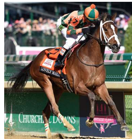
Lovely Maria