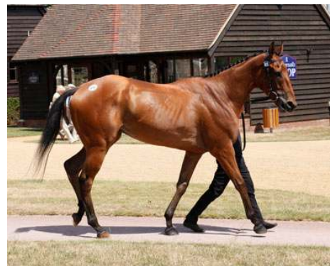
Sale Topper Go Dan Go | Tattersalls