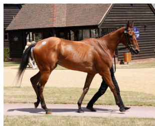
Go Dan Go | Tattersalls