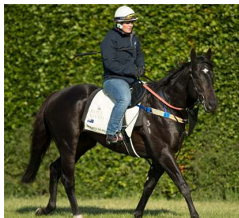
Brazen Beau | Racing Post

Twelve years ago, Juddmonte's subsequent sire sensation Oasis Dream (GB) downed the Antipodean god Choisir (Aus) on the gradients of Newmarket's July Course in an ultimate clash of the sprinting generations and since then Australian interest has been scant and unrewarded in the meeting's feature G1 Darley July