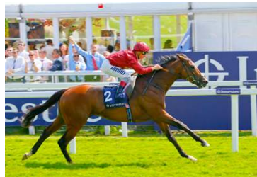
Arod

With the two favorites for Saturday's G2 Fred Cowley MBE Memorial Summer Mile at Ascot, Qatar Racing could well be celebrating a favorable outcome with either Arod (Ire) (Teofilo {Ire}) or Lightning Spear (GB) (Pivotal {GB}). Like chalk and cheese in what they have so far accomplished in the public realm, the former comes here on the back of a third in the G1 Lockinge S. at Newbury May 16 and a win in