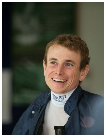
Ryan Moore

Ryan Moore will miss this weekend's racing action following a nasty incident before the final race at Newmarket on Thursday. Moore's mount Newton's Law became upset in the stalls and parted company with Moore in the process. Although the rider walked away