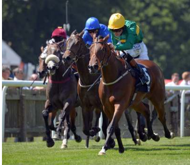
Illuminate | Racing Post