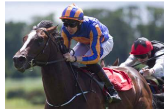
Air Vice Marshal

Newmarket's G2 Superlative S. has played host to some lofty talent in recent times and Saturday's edition, with so many unexposed types in the line-up, could possibly unearth another in the mold of Dubawi (Ire), Horatio Nelson (Ire) and Olympic Glory (Ire) (Choisir {Aus}). If the betting is the guide, then if it comes it will most likely be in the form of the almost obligatory Ballydoyle representative Air Vice Marshal (War Front), who was impressive when scoring over this trip at