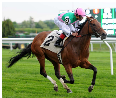
Riposte

Juddmonte Farms homebred Riposte (GB) (Dansili {GB}) hopes to return to the sharp form she displayed last term and score her first win of the season in Saturday's GIII Modesty H. at Arlington Park. Finishing