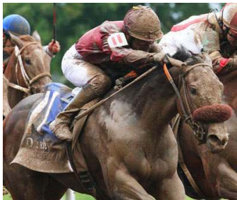
Peace and War