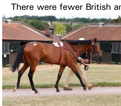
Lot 749 Vilman | Tattersalls

He added, "Year after year we reflect on the extraordinary level of international participation at the July Sale and other similar sales here at Tattersalls, and this week's renewal has been no exception. We felt that the catalogue had all the necessary ingredients to attract a diverse crowd of buyers and this has been reflected not only in the improved figures, but also, crucially for a sale of this nature, in the spectacular clearance rate of around 90%. The global appetite for British and Irish horses in training is as strong as ever, and equally encouraging has been the demand for well bred fillies and broodmares."