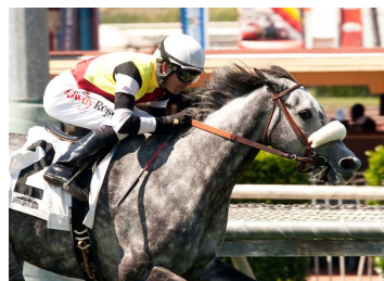
Gaga A