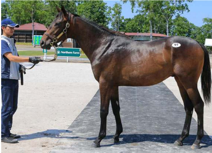
Hip 97, a Mineshaft half-brother to Palace Malice