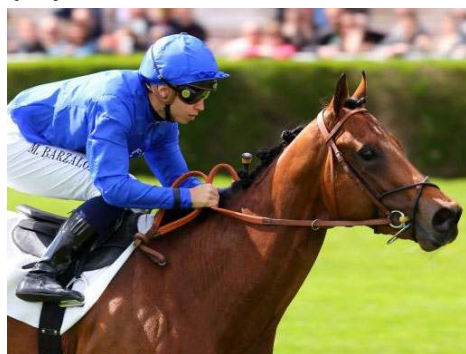
Territories looks to improve on his last-out Guineas second

Sunday's G1 Prix Jean Prat at Chantilly features two leading home-trained milers in Full Mast (Mizzen Mast) and Territories (Ire) (Invincible Spirit {Ire}) and a pair of high-profile British raiders in Dutch Connection (GB) (Dutch Art {GB}) and Kodi Bear (Ire) (Kodiac {GB}), all of whom are closely matched on ratings having already made their mark at this level. The former was the beneficiary of the demotion of Gleneagles (Ire) (Galileo {Ire}) in the G1 Prix Jean-Luc Lagardere at Longchamp