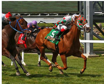
Tightend Touchdown

Tightend Touchdown made amends for a quartet of narrow misses over the Parx turf course with a triumphant return to the Bensalem oval in Saturday's GIII Parx Dash H. Runner-up in this event in 2013 and 2014 and second and third, respectively, in the GIII Turf Monster H. here during those same terms, the