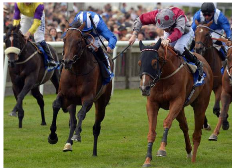
Muhaarar nails Tropics on the line in the July Cup | Racing Post

Meeting the older generation of sprinters for the first time in Newmarket's G1 Darley July Cup, Sheikh Hamdan bin Rashid Al Maktoum's Muhaarar (GB) (Oasis Dream {GB}) left his supporters sweating until the last possible moment, but ultimately showed all his class to prevail from the valiant veteran Tropics (Speightstown) in a thriller. Sent off the 2-1 joint-favorite alongside the ultimately disappointing Brazen Beau (Aus) (I Am