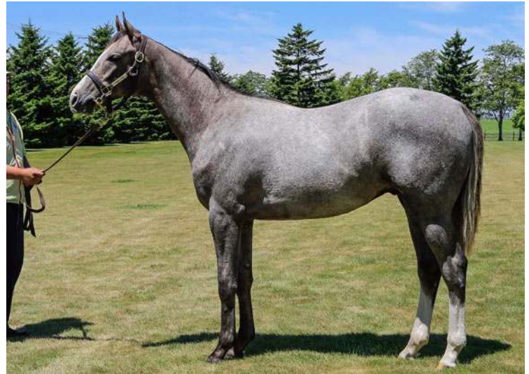
Hip 108, a Tapit colt out of Champagne d'Oro