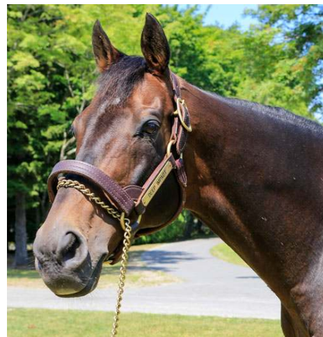
Champion sire Deep Impact at Shadai Saturday

A major part of the draw is Deep Impact, who continues to turn out talented offspring that can win anywhere, such as Australian Group 1 winner Real Impact (Jpn) and G1 Dubai Sheema Classic winner Gentildonna (Jpn). He also continues to receive the cream of the Shadai Group mares, as well as