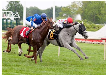
World Approval (6) gets the better of Crittenden