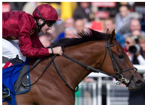
Just The Judge | Racing Post