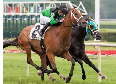
The Pizza Man

Batting .650 on the grass and the owner of an impressive 11-8-1-1 record over this course coming into this, The Pizza Man was third to Dark Cove (Medaglia d'Oro) in the 2013