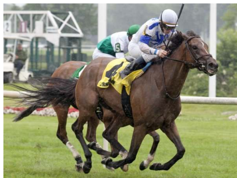
Walk Close

Walk Close, a winner of her first three career starts, including Belmont's Wild Applause S. last June, went