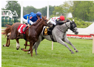
World Approval (6) takes the American Derby

Arlington Park staged its first big stakes program of the season, with four prep races for Arlington Million day Aug. 15. World Approval (Northern Afleet) earned his way into the GI Secretariat S. with a narrow defeat of Crittenden (Distorted Humor) in the GIII American Derby, while one-time claimer Quiet Force (Dynaformer) is likely to return for the Million after his victory in the GIII Arlington H. Walk Close (Tapit) pulled a mild upset in the GIII Modesty H., the course-and-distance warm-up for the GI Beverly D. S., and local favorite The Pizza Man (English Channel) will likely bypass a title defense in the GIII American St. Legger in favor of a much bigger payday in the Million.