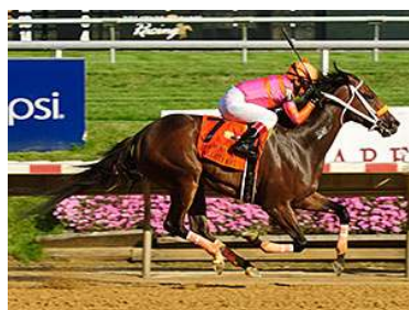
Calamity Jane

In the last handful of years, winners of the G1 Kentucky Oaks such as Proud Spell (Proud Citizen) and Blind Luck (Pollard's Vision) were able to tack on a victory in the valuable GIII Delaware Oaks. Lovely Maria (Majesticperfection) was