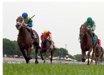
Quiet Force bests Middleburg (right) and Up With the Birds (yellow cap)