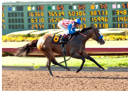
Fantastic Style

A debut second sprinting at Santa Anita on the second day of the winter/spring meet Dec. 27, the $525,000 OBS April graduate broke her maiden by