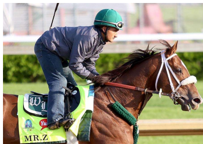
Mr. Z

In addition to a pair of graded events to be held at Delaware Saturday, the fields were drawn Wednesday for four more graded stakes spread between Del Mar, Indiana Grand and Arlington Park. Finnegans Wake (Powerscourt {GB}) seeks his second win at the highest level in the GI Eddie Read S., while Hogy (Offlee Wild) looks to capture a second renewal of Arlington's GIII Hanshin Cup S. Meanwhile at Indiana, the sophomores get the spotlight with Mr. Z (Malibu Moon) hoping to make it two in a row in the GII Indiana Derby and a full field of 11 fillies lining up for the GII Indiana Oaks.