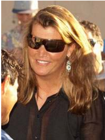
Vicki Oliver | Benoit Photo

The mare proved to be no worse for wear next out when blowing up the tote at odds of 32-1 in the GII Fleur de Lis H. in Louisville June 13, and has been pleasing her trainer in the mornings leading up to this test. Cont. p3