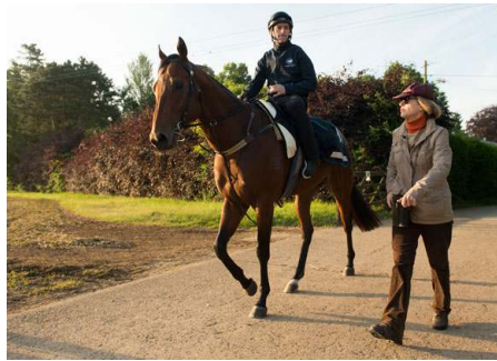
Gai and Wandjina in Newmarket | Racing Post