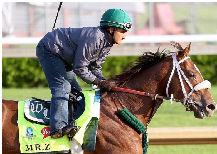
Mr. Z