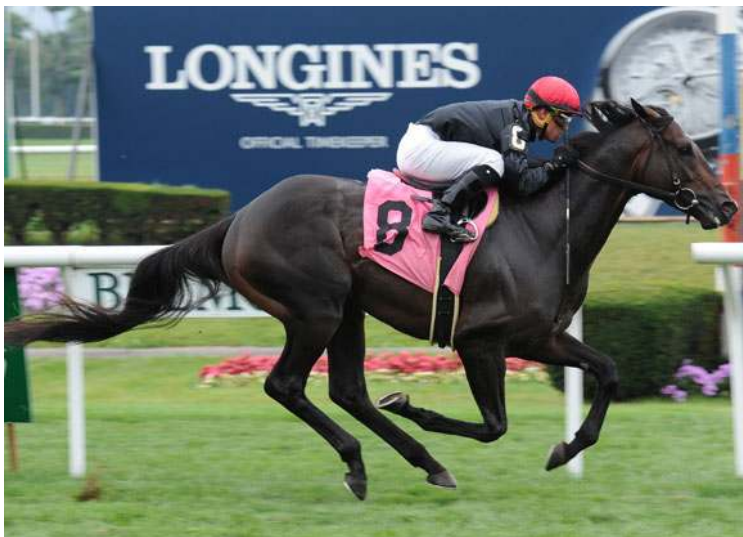
Mr Speaker back to winning ways