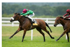
Euro Charline

Last year's G1 Beverly D. S. winner Euro Charline (GB) (Myboycharlie {Ire}) is on course for a title defense in the Arlington race following her fine effort in finishing second to Amazing Maria (Ire) (Mastercraftsman {Ire}) in the G1 Falmouth S. at Newmarket July 10. The lightly raced 4-year-old made a bright start to the season when running a highly creditable fourth to