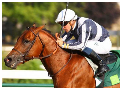
Erupt

In finishing a head second in the Prix Saint-Alary, Marie Nostrum narrowly failed to achieve the same Group 1-winner status already owned by her half-sister Aube Indienne (Yellow Ribbon S.). Erupt's third dam Grand Luxe has made a major contribution to Australian breeding, with her grandson Flying Spur and great-grandson Encosta de Lago both developing into champion sires. Another successful stallion, Holy