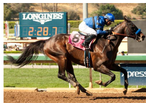
Sky Kingdom

Friday night's GIII Cougar II H. at Del Mar has attracted a field of seven, including Sky Kingdom (Empire Maker). The 6-year-old was second in the marathon race in 2013 and 2014. Trained by Bob Baffert on behalf of Westrock Stables, Sky Kingdom is coming off a third-place finish in the June 6 GII Brooklyn H. at Belmont Park.