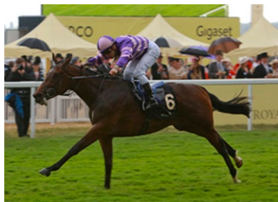
Royal Ascot winner Suits You

The catalogue for the LaTeste yearling sale has been released online and can be viewed at www.osarus.com . The sale will take place Sept. 15-16 at the Hippodrome de Bequex racecourse in the South-West of France, with 268 yearlings catalogued. This sale has an impressive record of unearthing high class horses at very reasonable prices, with the obvious example from