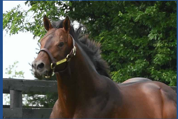
Super Saver's HIGH DOLLAR WOMAN Indiana Oaks (G2) Winner