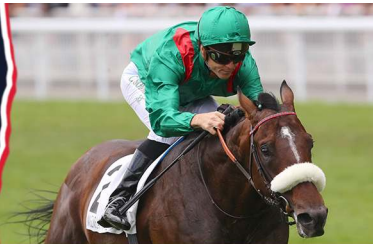
DARIYAN (FR) Gr.2 Prix Eugène Adam