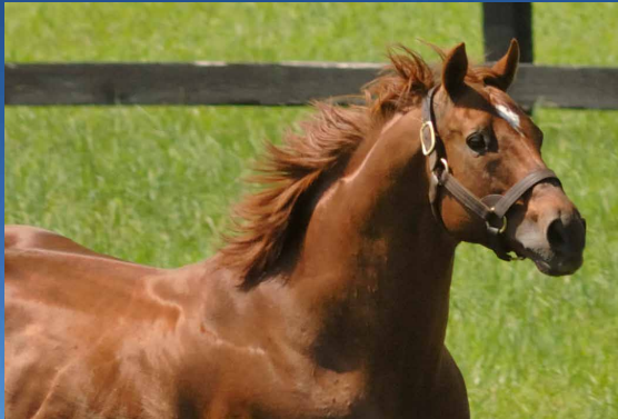
Distorted Humor's NONNA'S BOY Lamplighter S. Winner