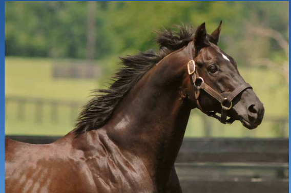
More Than Ready's READY FOR ROMANCE Ontario Damsel S. Winner