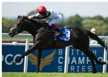
Golden Horn | Racing Post

Eleven horses have stood their ground for Saturday's G1 King George VI And Queen Elizabeth S. at Ascot, including star 3-year-old Golden Horn (GB) (Cape Cross {Ire}). Anthony Oppenheimer's homebred is now unbeaten in five outings and will be a heavy favorite to make it a perfect six on Saturday. Trainer John Gosden could also saddle a further pair of stablemates for the