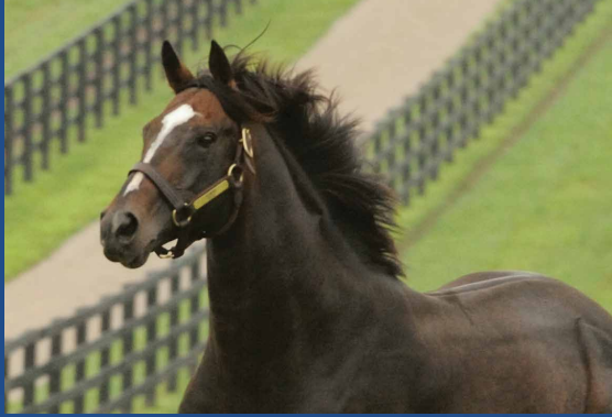
Tiznow's TIZ SHEA D Indiana Derby (G2) Winner