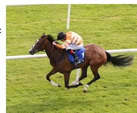
Covert Love | Racing Post

Although most racehorse breeders are a very different breed from the glowering Peggy, most of them would share her faith in the family, especially the female line. It's pretty much the foundation of every breeding operation, even though it is possible to argue that this concentration on the bottom line of a pedigree isn't particularly logical. After all, any horse's fifth dam is just one of 16 mares in the fifth generation and a five generation pedigree contains 62 individuals, not just the five mares in the bottom line.