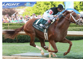
Danza