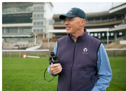
John Gosden

Trainer John Gosden has said he is "very pleased" with G1 Epsom Derby and G1 Coral-Eclipse winner Golden Horn (GB) (Cape Cross {Ire}) ahead of the 3-year-old's assignment in Saturday's G1 King George VI and Queen Elizabeth S. at Ascot. The Anthony Oppenheimer homebred looks to become just the fourth horse to complete the Derby-Eclipse-King George treble in the same year, and the first since Galileo (Ire) (Sadler's Wells) in 2001 to complete the Derby-King George double.