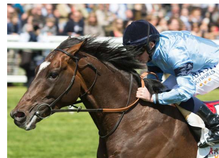
Telescope | Racing Post

Highclere Thoroughbred Racing's Telescope (Ire) (Galileo {Ire}) has been ruled out of Saturday's G1 King George VI and Queen Elizabeth S. after suffering a minor setback, and will now target an autumn campaign.