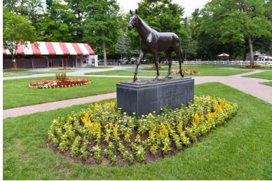
Saratoga Paddock

"Good horses get beat here and not everyone likes it," Lukas said. "But in my heart I think he is so much the best that I think he could run here and not worry about it."