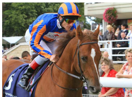
Starspangledbanner | Racing Post

"He covered 32 mares and ended up with 16 in foal, so 50% spot-on, which we were really happy with,"