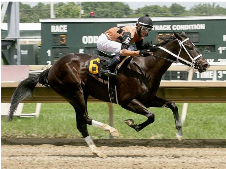
Little Miss Miss