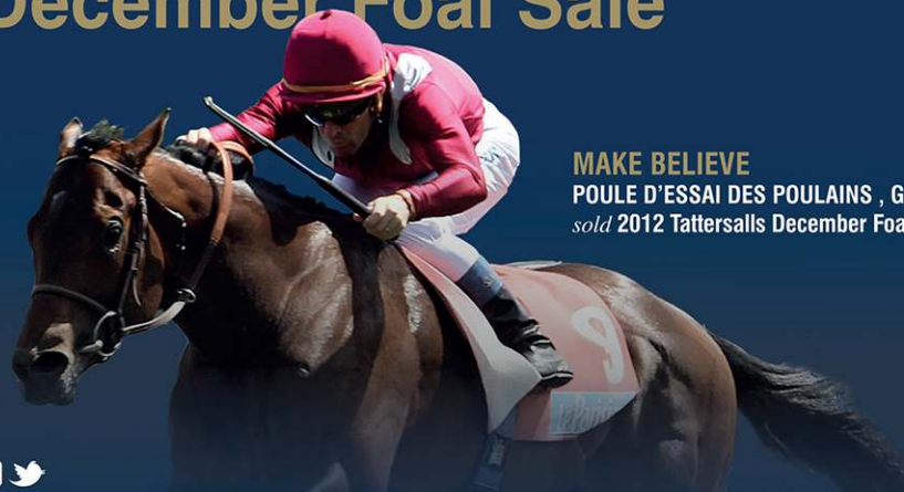
MAKE BELIEVE POULE D’ESSAI DES POULAINS , Group 1 sold 2012 Tattersalls December Foal Sale

In 23 of the last 25 years the 3 highest priced foals in Europe have all sold at the Tattersalls December Foal Sale