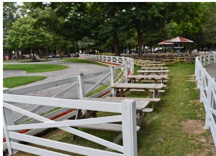
Paid Picnic Table Area

Hall of Fame trainer D. Wayne Lukas, who will celebrate his 80th birthday Sept. 2, said he still gets excited about the Saratoga season.