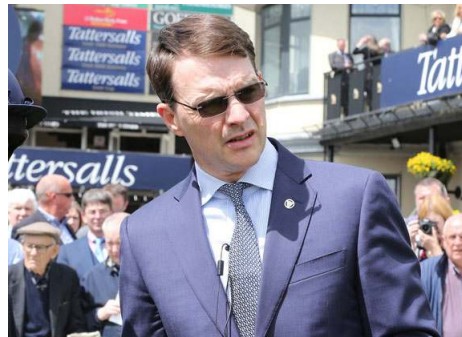
Aidan O'Brien has won four of the last six runnings of the Silver Flash