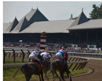
Heading for home at the Spa Sherackatthetrack

Historic Saratoga Race Course, America's oldest and most revered track, opens for business once again on Friday, launching the 147th summer of Thoroughbred racing in the city. The 10-race program, featuring the Gill Lake George S. and the Gill Schuylerville S., is the starting point of a 40-day season that runs through Sept. 7. During the 70th consecutive Saratoga season since WWII, the New York Racing Association will present what is generally considered the highest-caliber meet in the nation, highlighted by 69 stakes worth a record $18.7 million in purses. Cont. p4