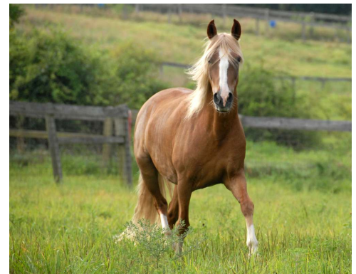
Paso Fino

So, here is the question for us to ponder... This gentlemen from Bogota, Colombia, was going to make an educated wager and probably watch a