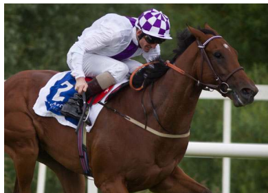
Sanus Per Aquam