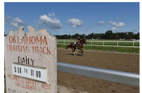
Oklahoma Training Track

Sometime during the meet, Pletcher expects to saddle 2-year-old Rachel's Valentina for a career debut that is likely to receive a lot of attention. The daughter of Bernardini out of Horse of the Year, Rachel Alexandra, who beat males in the 2009 GI Woodward, has been developing in Saratoga for a couple of months.