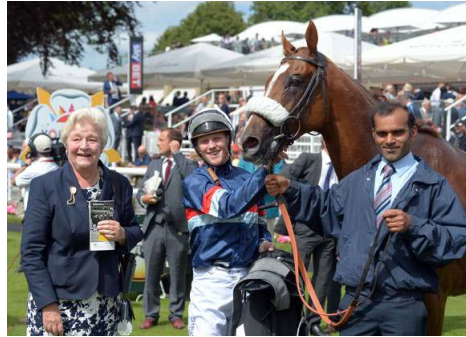
Tullius and the winning connections | Racing Post