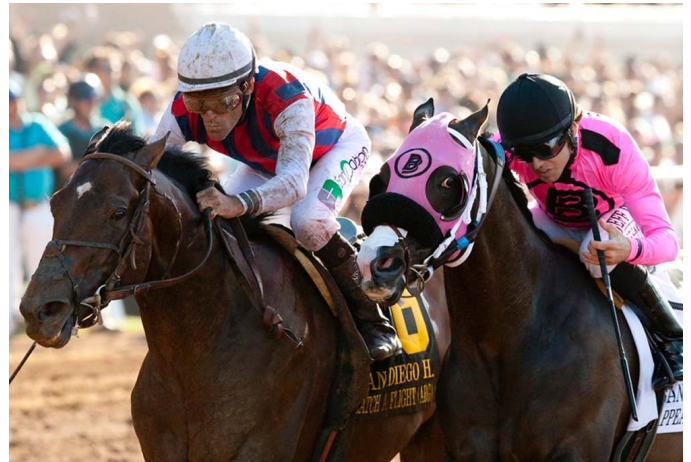
Catch a Flight (left) sweeps past Appealing Tale