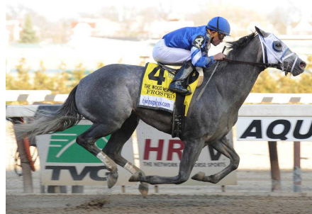
Frosted

Competition in the Jim Dandy figures to come from a few rivals, including Upstart (Flatter), who is set to make his first appearance since finishing last of the 18 to contest the GI Kentucky Derby May 2.