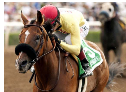
Masochistic

Masochistic (Sought After) seeks his fourth-consecutive tally with an automatic bid to the GI Breeders' Cup Sprint on the line in Sunday's GI Bing Crosby S. at Del Mar. The Cal-bred kicked off his 5-year-old season with a