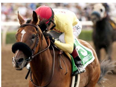
Masochistic