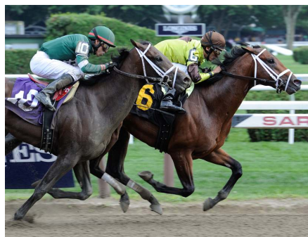
Saratoga Mischief

+ SARATOGA MISCHIEF (c, 2, Into Mischief --Pacific Destiny, by Mr. Greeley), a $220,000 KEENOV weanling that developed into a $360,000 FTSAUG yearling, was let go at 6-1 despite a half-mile best-of-60 bullet work from the gate here in :48 July 4 and his