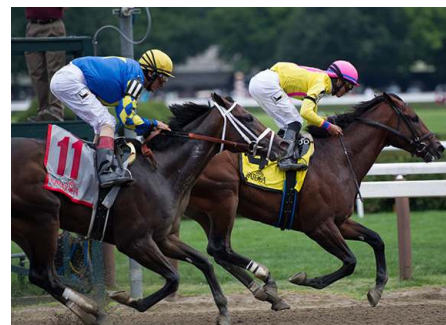
Magna Light crosses the wire ahead of Uncle Vinny