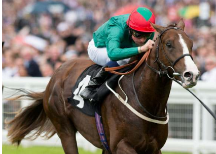
Sixth Sense | Racing Post

Sent straight to the front by William Buick, he was threatened on either side passing the quarter pole but they soon became bogged down as he extended his advantage despite drifting left on the run to the line. "You can see from that similar run in the Chesham that