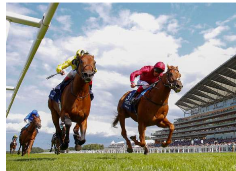
Postponed (rail) noses out Eagle Top in the King George | Racing Post

In a rain-blighted renewal marred by the withdrawal not only of its chief protagonist Golden Horn (GB) (Cape Cross {Ire}) but also of the interesting contender The Corsican (Ire) (Galileo {Ire}) and the solid Flintshire (GB) (Dansili {GB}), Saturday's G1 King George VI and Queen Elizabeth S. was at least partly salvaged by a thrilling duel up Ascot's stretch in which Postponed (Ire) (Dubawi {Ire}) edged out old rival Eagle Top (GB) (Pivotal {GB}) by a nose.