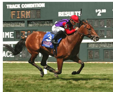
Saham

Saham closed out his winter campaign with a 1 1/2-length graduation in his fourth career start over a grassy 7 1/2 panels at Gulfstream Feb.14. The dark bay resurfaced in Keeneland's GIII Transylvania S. over a soft course Apr. 15, and checked in third beaten less than a length by Night Prowler (Giant's Causeway)--only to be subsequently disqualified from the purse money. The colt finished fourth in the PDJF S. at Indiana Grand May 30 and recently was narrowly beaten