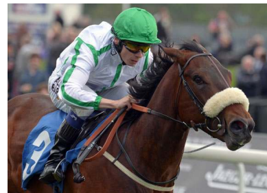
Areen looks to rebound | Racing Post