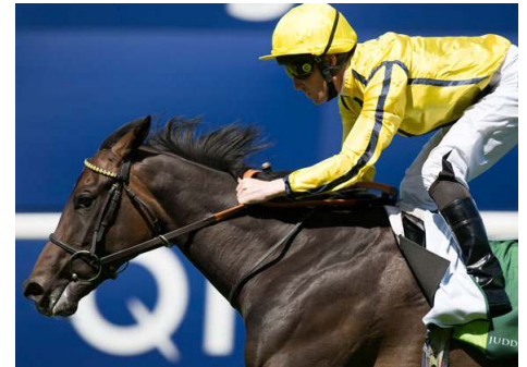
Besharah

Off the mark in what turned out to be a decent maiden over five furlongs at this track May 8, Besharah received further education en route to the Royal meeting when defying a penalty and besting Whatdoiwantthatfor in a Windsor conditions event June 1. No match for Acapulco (Scat Daddy) when third in the G2 Queen Mary S. staying over five furlongs at this venue’s mid-summer feature meeting June 17, the bay showed that this trip held no fears when a nose second to Illuminate (Ire) (Zoffany {Ire}) in the July 10 G2 Duchess of Cambridge S. at Newmarket.