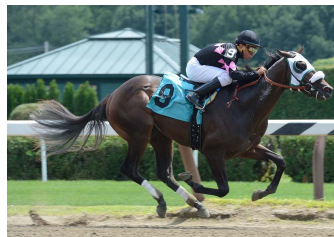
Realm | A. Coglianese

1st-SAR, $83,000, Msw, 7-25, 2yo, 5 1/2f, 1:05.00, ft. + REALM (c, 2, Haynesfield--Shawnee Country {MGSW, $430,660}, by Chief's Crown), let go at 11-1 due to the presence of heavily favored $675,000 OBSMAR buy Moon King (Malibu Moon), remained glued to the chalk's outside hip through early splits of