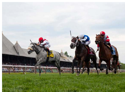
L to R: Hard Not to Like, Tepin, Kitten's Queen