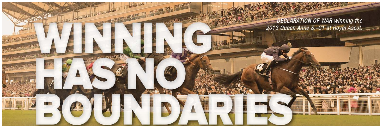
DECLARATION OF WAR winning the 2013 Queen Anne S.-G1 at Royal Ascot.