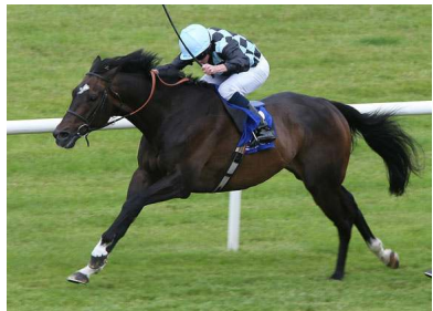
British raider Air Pilot

Returning to Munich on Sunday to the scene of his triumph in the G1 Grosser Dallmayr-Preis 12 months ago, Gestut Winterhauch's Lucky Lion (GB) (High Chaparral {Ire}) bids to prove his defeat of the subsequent G1 Champion S. hero Noble Mission (GB) (Galileo {Ire}) was no fluke. Also successful in the G2 Mehl-Mulhens-Rennen, or German 2000 Guineas, at Cologne last May and second in the G1 Deutsches