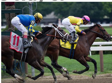
Magna Light crosses the wire ahead of Uncle Vinny

Magna Light (Magna Graduate) was first past the post in Saratoga's GIII Sanford S. Saturday afternoon, but it was Uncle Vinny (Uncle Mo) who claimed all the glory with help from the stewards, after the former impeded his rivals with some midstretch hijinks. Their ruling gave Ashford Stud resident and 2010 juvenile champ Uncle Mo (Indian Charlie) his first graded-stakes winner as a sire from his first crop of runners.