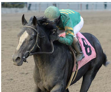
Honor Code