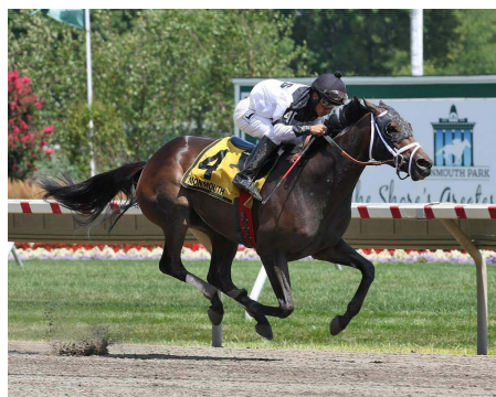
Got Lucky

Got Lucky, who was second in both the GII Rachel Alexandra S. and GII Gazelle S. as a sophomore, wrapped up the season with fifth-place finishes in the GI Alabama S. and GI Spinster S. in October. Got Lucky returned from a three-month break to annex a Gulfstream optional claimer Jan. 15 before a fifth in the GIII Rampart S. Feb. 21. She's done well since coming