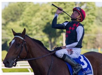
Texas Red