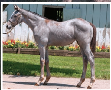
Trimmed In Black, filly, dob 5/2/15 foaled KY