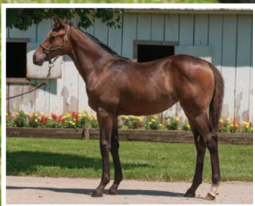
Bimini Road, filly, dob 3/21/15 foaled KY