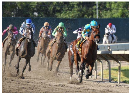
American Pharoah takes control