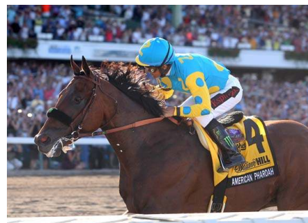
American Pharoah

“We have to get him home and see how he bounces out of this [before making a decision on his next race],” Baffert said. “There are a lot of options out there. It doesn’t make sense running him against the older horses right now. It’s all about the timing and spacing. I know when I get back to my home track at Del Mar, they will have a lot of pressure on me right there in my back yard. We have to get him home first and see what we’ll do. I want to do the right thing for American Pharoah. It’s a race-by-race thing.”