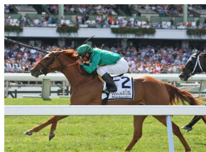
Casual Smile