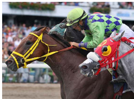
Wildcat Red and his distinctive yellow bridle home first in the Teddy Drone

Victorious in last year's GIII Hutcheson going seven furlongs and the GII Fountain of Youth S. going two turns, Wildcat Red was a game second in the GI Florida