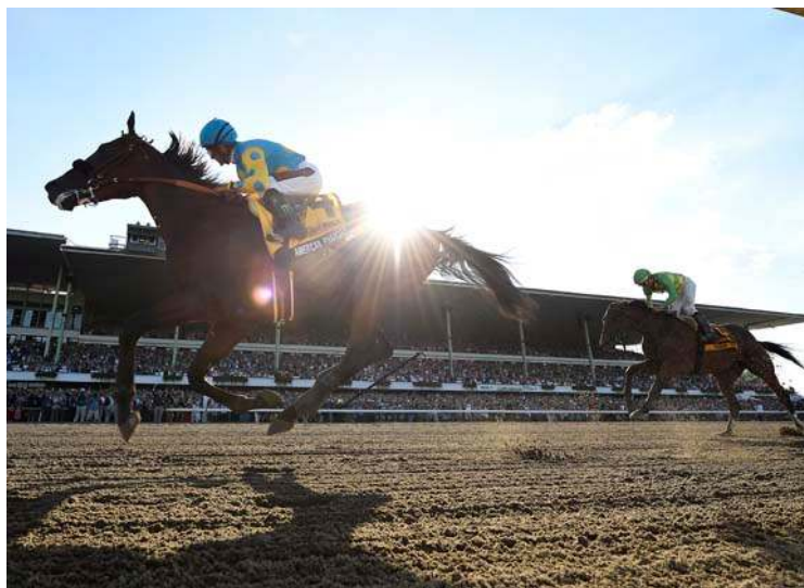
American Pharoah glides home first.

A # will distinguish first-time stakes-winners, a @ will indicate first-time graded stakes-winners, a & will denote a first-time Grade/Group 1 winner, a + will indicate first-time starters, an (S) will be used for state-bred races.