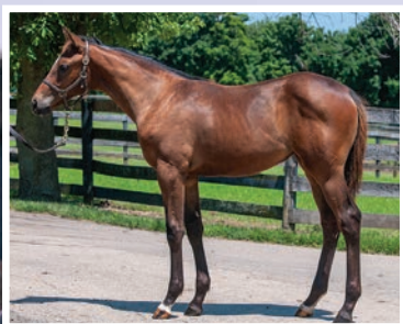
Lisbonvale, filly, dob 3/9/15 foaled KY

[ Jump Start - Hunt's Corner, by Silver Ghost ]