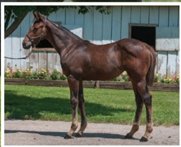
Star Forty Nine filly, dob 4/17/15 foaled KY