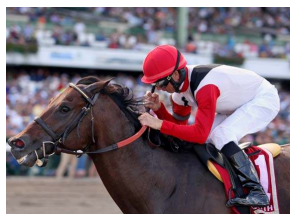
Bradester