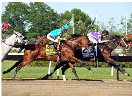
American Pharoah chases Competitive Edge into first turn with Mr. Jordan in third.

“It was pretty easy,” Espinoza said of the race. “For me, the key was just coming out of there running. I didn’t want to get into any bumping out of the gate, I just wanted to let him run his race. I knew that other horse would want to take the lead, so I sat back just a little bit. I never like to go head and head with another horse, so I sat back maybe half a length behind. He did everything by himself. It was pretty easy, pretty impressive.”