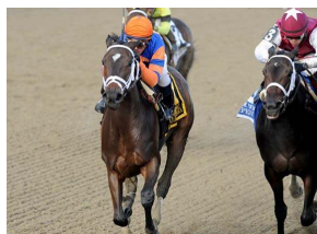
Stopchargingmaria

Stopchargingmaria (Tale of the Cat), already a two-time Grade I winner at Saratoga, outbattled sophomore filly champion Untapable (Tapit) to win Sunday's GIII Shuvee H. at Saratoga. "You can see in Stopchargingmaria's personality that she loves it here at Saratoga," said winning trainer Todd Pletcher.