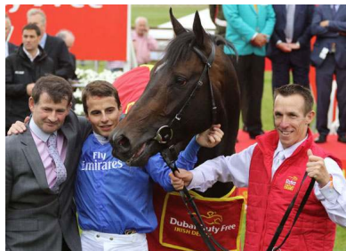
Jack Hobbs

G1 Irish Derby victor Jack Hobbs (GB) (Halling), initially expected to target the G2 Prix Niel Sept. 13 as a prep for the G1 Prix de l'Arc de Triomphe, could instead have his next outing closer to home in the G3 Legacy Cup at Newbury a week later.