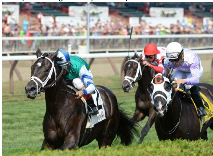
Azar breaks his maiden in the With Anticipation

"It worked out better today," winning jockey John Velazquez explained. "The last time he ended up being on the lead and getting out and looking around and [wasn't] really focused on what he needed to do. Today he was following somebody and when I pulled him out, he responded right away." Chart p4