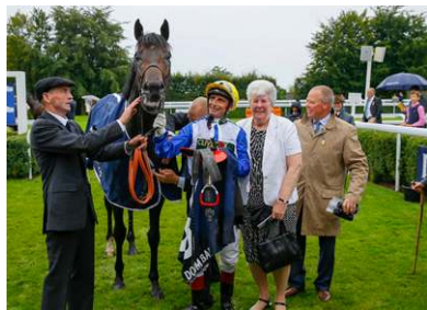
Kodi Bear and connections at Goodwood | Racing Post