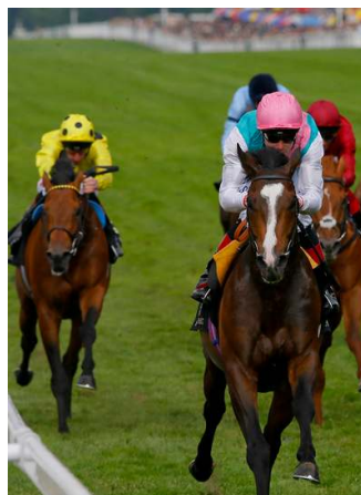
Snow Sky