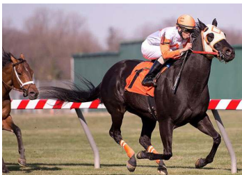
Ben's Cat won the Mister Diz for the sixth straight time Aug. 22 |