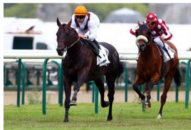
Vadamos