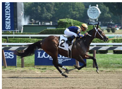
Nickname

NICKNAME (f, 2, Scat Daddy --Nina Fever {MSP, $216,517}, by Borrego ), fourth behind 'TDN Rising Star' Rachel's Valentina (Bernardini--Rachel Alexandra)