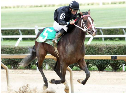
Bullet Gone Astray