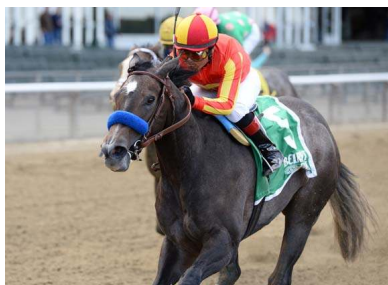
Pretty N Cool

Pretty N Cool (Scat Daddy), second behind the unbeaten Songbird (Medaglia d'Oro) in the Sept. 5 GI Del Mar Debutante, bypassed another match-up with that divisional leader and shipped east for a hard-fought victory in Sunday's GII Matron S. at Belmont Park. The gray filly, favored at 4-5, broke alertly and was soon on the lead. She was pressed by 'TDN Rising Star' Constellation (Bellamy Road) and Libreta (Girolamo) through fractions :22.39 and :44.96. Pretty N Cool looked poised to sail home, but Constellation fought back grimly along the rail. The favorite found the measure of that foe in the final strides to win going away. Tonasah (Malibu Moon) ran on for third.