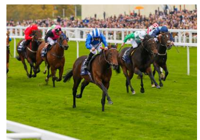
Muhaaarar winning at Ascot