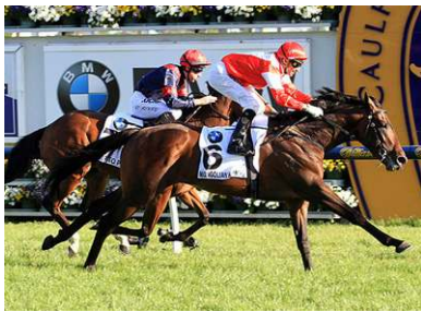
Mongolian Khan | Racing And Sports