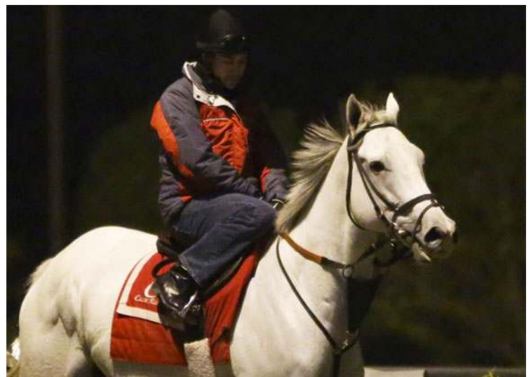
Za Approval heads back home after training

O-Live Oak Plantation; B-Live Oak Stud (KY); T-Mark E Casse.