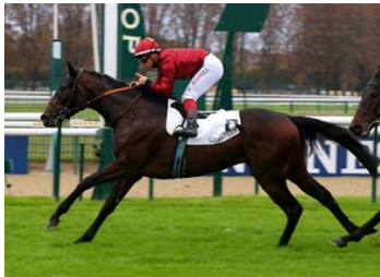
Ming Dynasty | Scoop Dyga

Having beaten Migwar in the Aug. 25 Listed Grand Prix de Clairefontaine, Ming Dynasty was only sixth when that rival was third in the G2 Prix Niel at Longchamp Sept. 13 and was underestimated here as a result. Settled in fifth early by