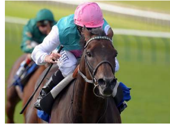
Time Test | Racing Post