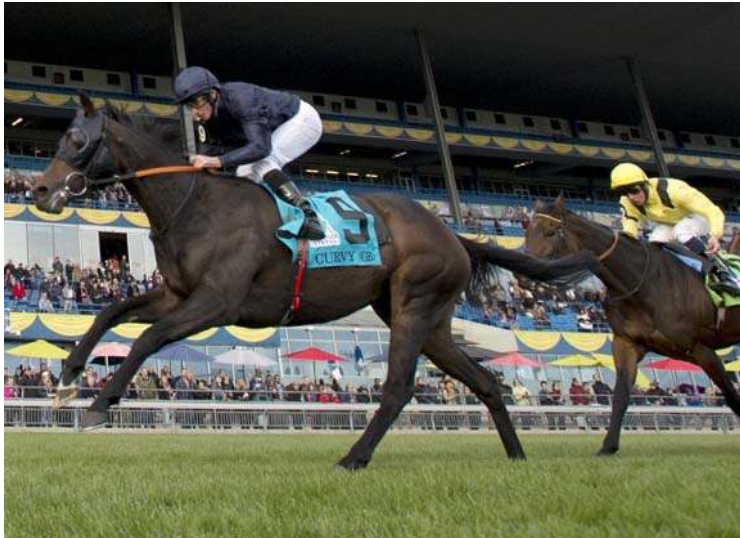
Curvy