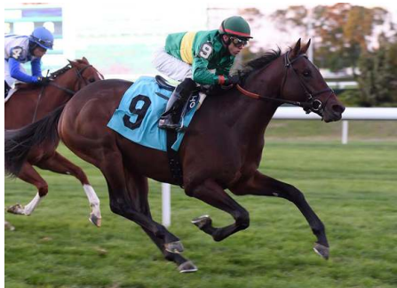
Catapult

10th-BEL, $75,000, Msw, 10-18, 2yo, 1mT, 1:34.42, fm. +CATAPULT (c, 2, Kitten's Joy --Gata Bella, by Storm Cat) found his best stride late and earned a debut victory in the Belmont nightcap Sunday, capping off a four-win day for both trainer Chad Brown and jockey Irad Ortiz, Jr. The dark bay first appeared on the worktab in Elmont Aug. 16 and spent a few