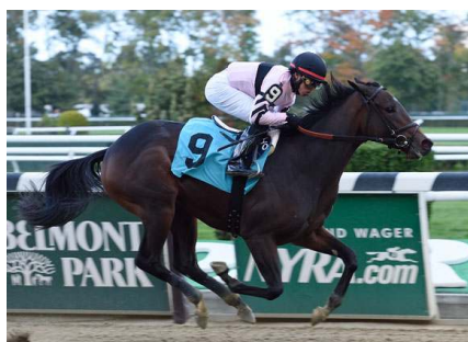
Lewis Bay

LEWIS BAY (f, 2, Bernardini -- Summer Raven {GSW, $168,910}, by Summer Squall ) set a quick pace and was caught in deep stretch when second in her six-panel debut in the mud here