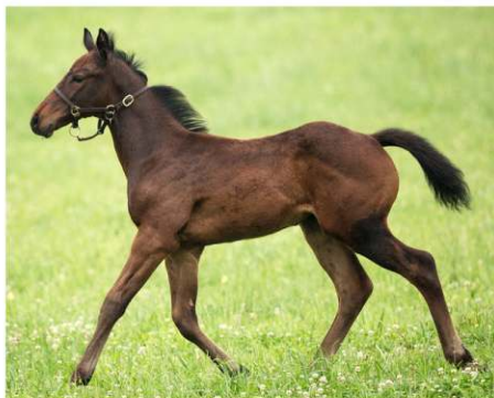
Diamond Beauty filly