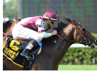
Divisidero