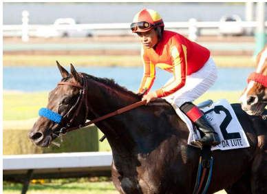
Gimme Da Lute