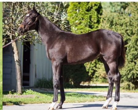
Out Of Reach colt

Top Aussie speed sire Denman’s American weanlings are at the sales. He’s the lightning-fast son of Lonhro, whose own first U.S. crop is doing so well on the track.