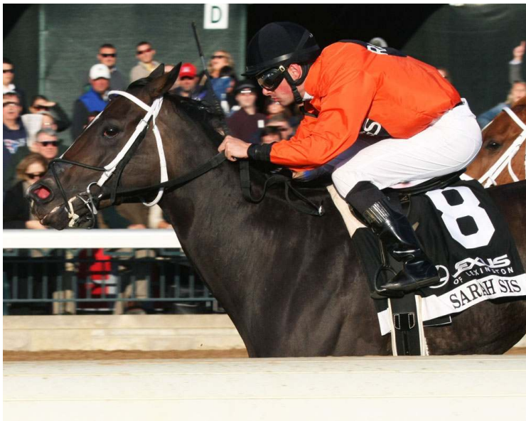
Sarah Sis | Coady Photography

The November sale continues through next Friday, with sessions beginning daily at 10 a.m. Cont. p4