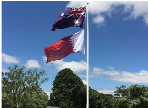
Swettenham Stud flagpole with the Qatari & Australian flags

offers a speedier element to the stallion roster, as does the G1 TJ Smith S. winner Master Of Design (Aus) (Redoute’s Choice {Aus}), whose $2.1 million yearling price tag is testament to the fact that he has the looks and swagger to match his pedigree and race record.