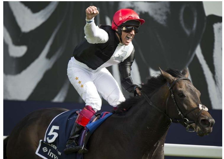
Golden Horn