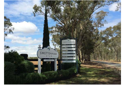
Swettenham Stud sign