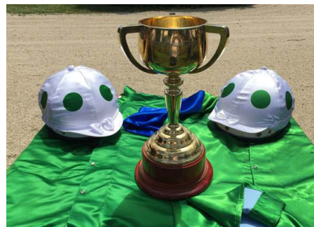
Swettenham Stud silks & the Melbourne Cup Trophy