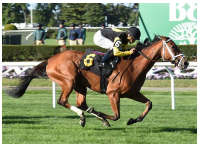
Gotachancetodance

On-pace types usually fare best in the Gill Long Island H. at Aqueduct, but with an apparent abundance of early speed signed on, it may be best to look for one of the come-from-behinders in Saturday's 12-furlong test.