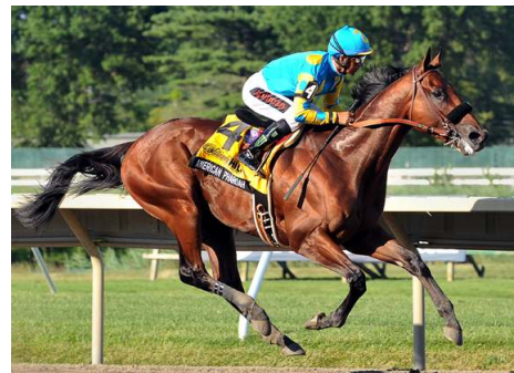
American Pharoah

The 2014 champion juvenile male, who is likely to add Horse of the Year and champion sophomore male this year, officially retired to Ashford Monday, Nov. 2, and with a record of 11-9-1-0 and $8,650,300 in earnings. In addition to seven wins at the highest level in the GI Kentucky Derby, GI Preakness S.,