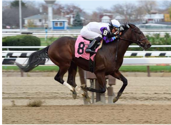
Seymourini