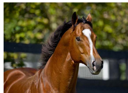
Not A Single Doubt