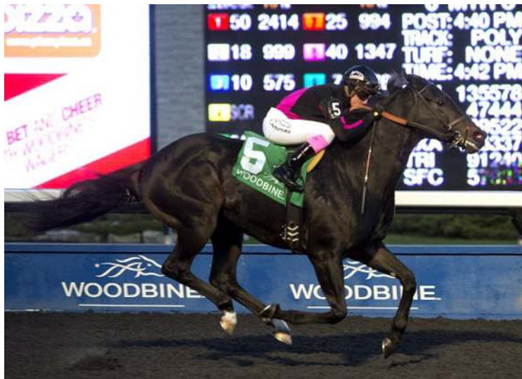
Stacked Deck