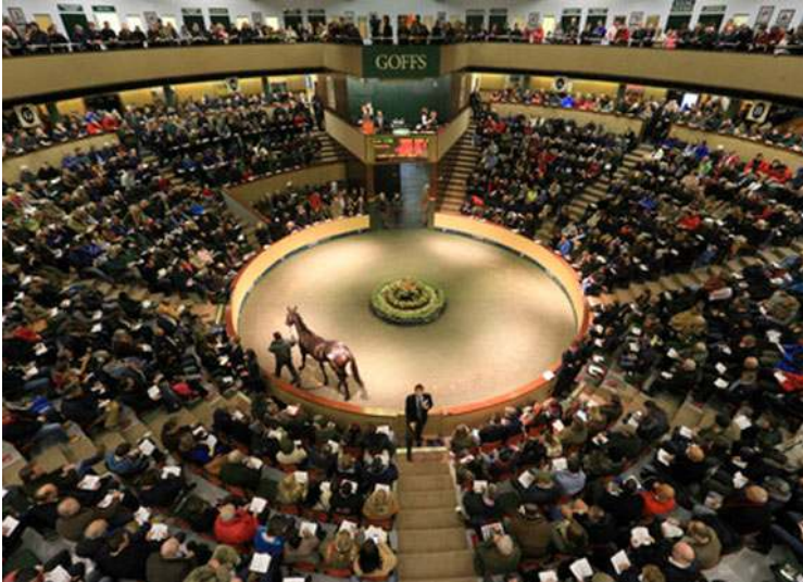
The Goffs sales pavilion | goffs.com