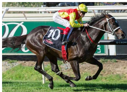
Good Project | Inglis

It is a leap of faith to send a horse to race 3,000 miles from home. It is also a leap of faith to run a horse in a Group 1 race when he has no stakes form whatsoever to his name. To combine the two, therefore, is a very bold venture indeed.