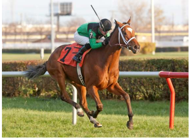
The Pizza Man

GI Arlington Million winner The Pizza Man (English Channel), who disappointed when fifth in the GI Breeders' Cup Turf Oct. 31, looks to redeem himself in the GII Hollywood Turf Cup at Del Mar. The Midwest