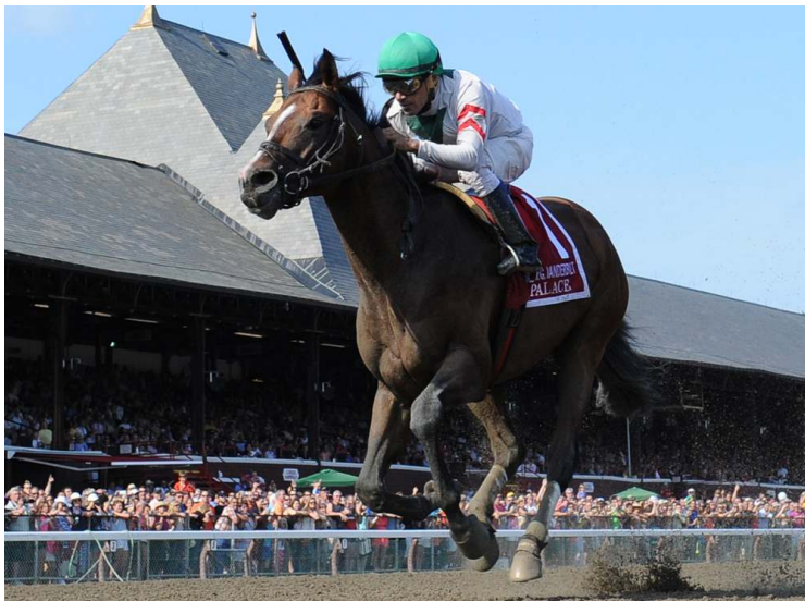
Palace