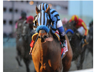
Private Zone