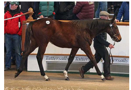
Lot 489, colt by Epaulette | Tattersalls

Epaulette joined his half-brother Helmet (Aus) on the Darley roster and Helmet, whose first runners will take to the track in 2016, was also responsible for one of the