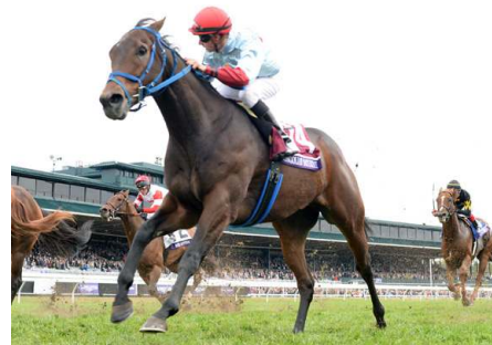
Mongolian Saturday

Saturday), who upset the field from his high draw in the G1 Breeders' Cup Turf Sprint Oct. 31, adds plenty of color to the Sprint, given his Mongolian connections, while Green Mask (Mizzen Mast), a running-on third in the