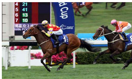
Designs on Rome | HKJC.com