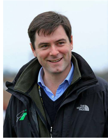
Mick Flanagan | Tattersalls

Lethal Force ended the second session as leading sire by average of those with more than one foal sold, his seven