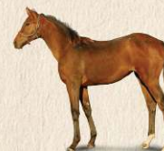
2015 Filly Out of INDY BUSINESS