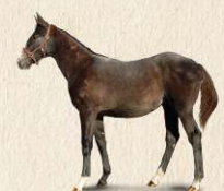
2015 Colt Out of INDIZ