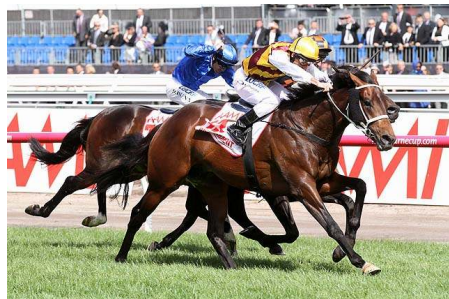
Preferment | Racing and Sports

Typically the 'black sheep' of the HKIR family, this year's HK$16.5-million (US$2.1 million) G1 Longines Hong Kong Vase may lack horses of the quality of a Golden Horn or Found (Ire) (Galileo {Ire}), but should be the best edition of the race in some time. No fewer than 11 of the 14 selected runners have succeeded at the highest level, including Flintshire (GB) (Dansili {GB}), who proved a popular winner of the Vase in 2014, but has horses much better than Willie Cazals (Ire) (Aussie Rules) and