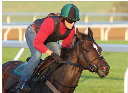
Frivolous