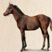
2015 Colt Out of BETWEEN RAINDROPS

OXBOW'S KEENELAND NOVEMBER WEANLINGS AVERAGED $105K - SIX TIMES STUD FEE!