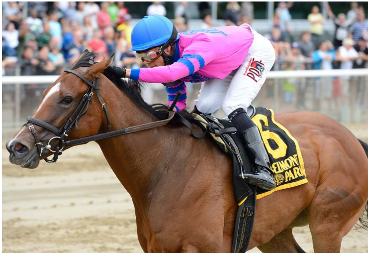
La Verdad