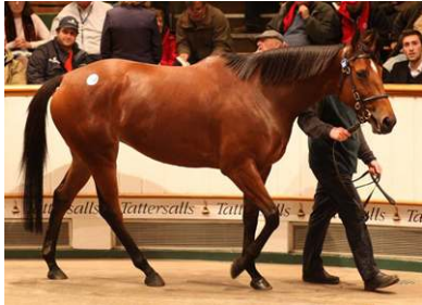
Qualify