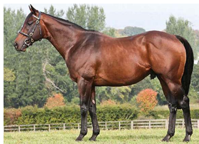
Dandy Man | Ballyhane Stud

2012 and with Dandy Man it is up to the end of 2015. In the context of racecourse performance, their first three crops are the relevant ones to examine and despite Dandy Man having 15% less progeny of racing age during this time which were sired off a 17% lower average nomination