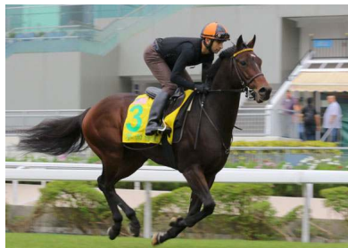
Green Mask

“Green Mask changed legs a couple of times but that is to be expected for a horse coming from the U.S. where they race left-handed,” said the jockey. “He was thinking about things at