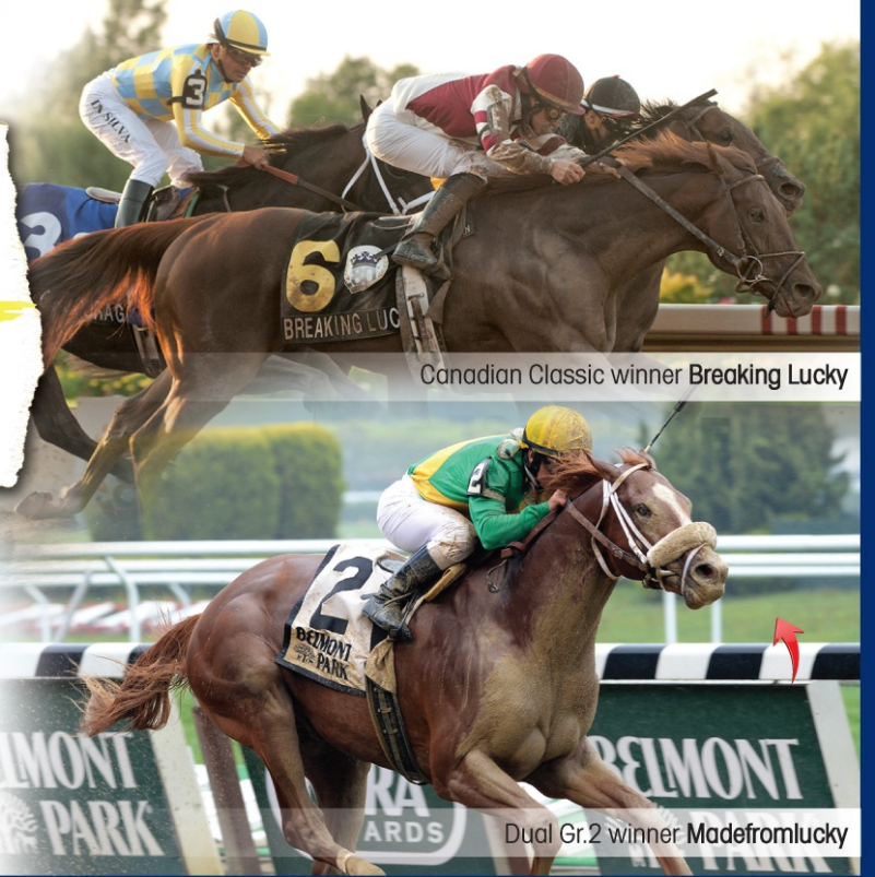
Canadian Classic winner Breaking Lucky