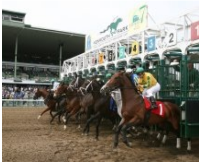
Monmouth Park

Some foreign-based exchanges accepted accounts from U.S.-based customers in the early part of the 2000s, but that practice was halted in 2006, when Congress passed the Unlawful Internet Gambling Enforcement Act that required banks and credit-card companies to block transactions with