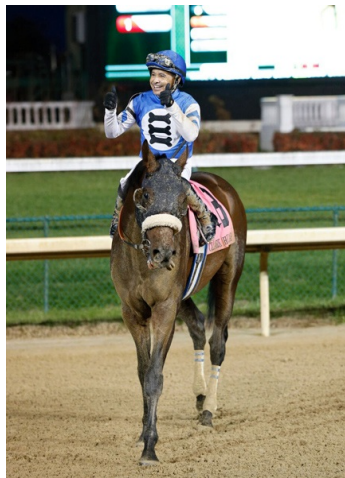
Effinex returns after winning the GI Clark H. Nov. 27