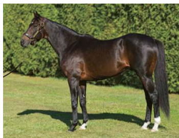
Deep Impact | Racing Post

Deep Impact (Jpn) (Sunday Silence--Wind In Her Hair {Ire}, by Alzao), who looks set to be crowned champion stallion in Japan for the fourth time, has had his covering fee increased to ¥30m ($244,000) for 2016, up ¥5m ($40,500) on this year’s fee.