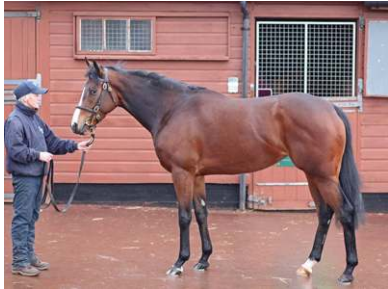
Tiggy Wiggy | Tattersalls

The only other lot to pass 2 million gns Tuesday was the speedball Tiggy Wiggy (Ire) (Kodiak {Ire}) (lot 2019 ), whose stellar juvenile season culminated in success in the G1 Cheveley Park S. Ferguson placed a few early bids but left the ring after she reached 1.7 million gns, leaving the door open for MV