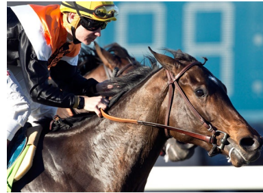
Family Meeting

The 2-year-old filly Family Meeting got the ball rolling Saturday afternoon when producing a powerful late run to capture the