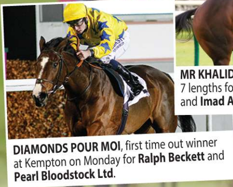
DIAMONDS POUR MOI , first time out winner at Kempton on Monday for Ralph Beckett and Pearl Bloodstock Ltd.

7 WINNERS SINCE MID-OCTOBER (FROM HIS FIRST 2YO CROP) INCLUDING: