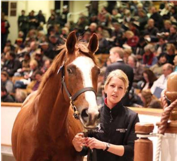
Hanky Panky | Tattersalls