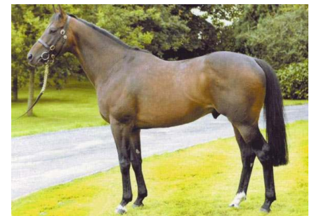
Kodiak | Tally-Ho Stud

Inevitably, such a rise in nomination fee will put him out of the reach of those breeders at the low-to-middle end of the market, so for those that wish to avoid the risks of using unproven sires, the search is on for a proven sire at the lower end of the nomination fee scale that has the potential to erupt into the next Kodiak in terms of commercial appeal.