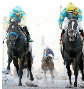
Pioneer of the Nile (outside) and I Want Revenge