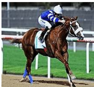
So Shiny (Arg)

One night after My Indy (Arg) held off Happy Boy (Brz) (Ski Champ) to capture the G3 Al Maktoum Challenge Round 2, another runner by Indygo Shiner was an easy winner of the $250,000 Listed UAE 1000 Guineas at Nad Al Sheba. So Shiny (Arg) was an eight-length maiden winner at Palermo last March in her second