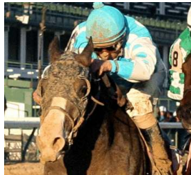
Giant Oak Reed Palmer

No fewer than 13 sophomores have shown up for today's GIII Risen Star S. at Fair Grounds, including most of the participants from last month's GIII Lecomte S. But there are two new shooters coming back from