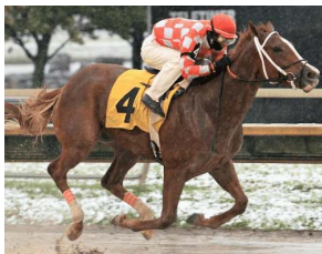
Just Jenda

Just Jenda and Four Gifts meet for the third straight time here. The former began her career with two in a row at Philly Park last term, including a nine-length tally in the Brandywine S. in October. She suffered her first career defeat when fifth, beaten 6 1/4 lengths by Four Gifts in the GIII Delta Princess Dec. 5, but turned the tables on that rival last time with a 1 3/4-length tally in the Jan. 10 Tiffany Lass S. Four Gifts had a two-race winning