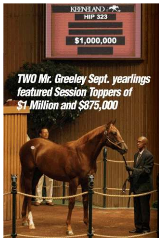
TWO Mr. Greeley Sept. yearlings featured Session Toppers of $1 Million and $875,000