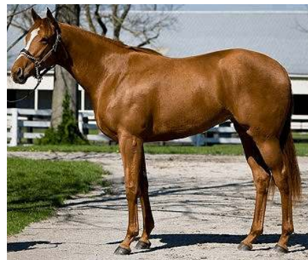
Hip 143 EquiSport

The chestnut filly is by freshman sire Ghostzapper out of Belva (Theatrical {Ire}), the dam of 2007 turf champion English Channel (Smart Strike).