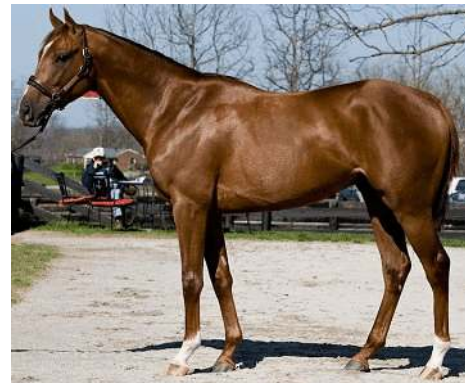
Hip 22 EquiSport