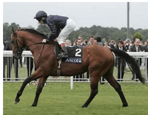
Duke of Marmalade

Coolmore stallions Duke of Marmalade (Ire) (Danehill--Love Me True, by Kingmambo) and Henrythenavigator (Kingmambo--Sequoyah {Ire}, by Sadler's Wells) will shuttle to Australia this spring with Coolmore Australia announcing that the Group 1 winners will be joining its 2009 stallion roster. Duke of Marmalade and Henrythenavigator were dominant figures throughout Europe in 2008, winning nine Group 1 between them.