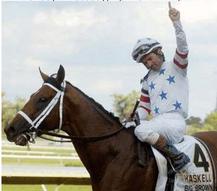
Keeneland April Graduate Big Brown

Two-Year-Olds In Training Sale Monday & Tuesday, April 6-7 • 7 p.m.