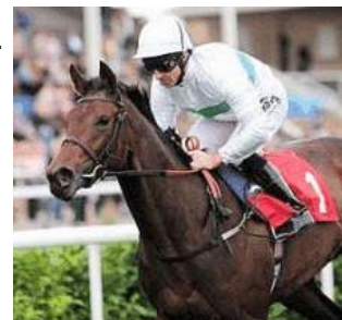
Rainbow View