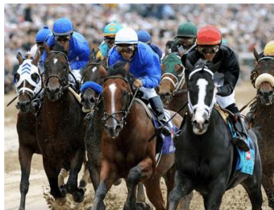
Clubhouse turn

Ignored at the windows, Mine That Bird got a bit squeezed at the start after breaking from post eight, but that didn't worry Borel even a little. The Churchill-based rider dropped his mount over to the rail ap-