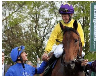
Frankie Dettori congratulates Mick Kinane

After an eye-catching fourth on debut in a hot seven-furlong Curragh maiden in July, Sea the Stars registered a 2 1/2-length success at Leopardstown the following month before tackling the Beresford over a mile back at the former venue. Showing battling qualities, as well as speed, to best stable companion Mourayan (Ire) (Alhaarth {Ire}) by a half-length on that occasion, he was put away for the year. After following the script in his early preparation, the colt had to overcome a glitch when missing work due to a raised temperature. Back on track quickly, he arrived to post here with stealthy support behind him and showed zest early, racing close to the pace towards the stands side of the group. Making a sweeping move to mirror that of Delegator and Jamie Spencer on the far side, he proved the stronger of the pair as they dueling up the rising ground. "He's a classy horse and we've been waiting for him all winter," jockey Mick Kinane commented. "He had a setback five weeks ago which put him two weeks behind, but luckily he was well ahead of schedule before that. I've been excited about him since day one, and he has always found going quick very easy. He has all the qualities that a good horse has and is the complete article."