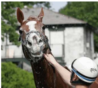
Summer Bird at Belmont

Daily Racing Form is reporting that Summer Bird (Birdstone) will point for the $1-million GI Haskell Invitational at Monmouth Aug. 2. The GI Belmont S. hero returned to his Louisiana Downs base Tuesday night.