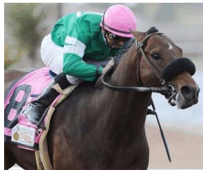
Kelly Leak