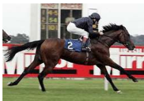
Rip Van Winkle

Aidan O'Brien was in no hurry to name targets for his weekend Classic runners after declaring himself "happy" with their efforts. Second, third, fourth and fifth in the G1 Epsom Derby and third in the G1 Prix du Jockey-Club at Chantilly the following day, the Ballydoyle conditioner is looking at a trio of races for the vanquished. "We were obviously disappointed when we didn't win, but we were very happy as well that all the horses ran well," O'Brien said. "All those horses that ran in England and France are in the mix for the G1 Irish Derby [at The Curragh June 28], G1 Eclipse S. [at Sandown July 4] and the new French Derby [July 14 G1 Grand Prix de