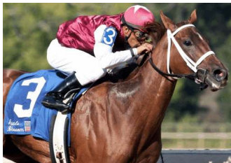
Seventh Street

Seattle Smooth (Quiet American), perfect in two starts this season, will face a three-pronged challenge from Darley/Godolphin in Saturday's G1 Ogden Phipps H. at Belmont Park. After attracting just five betting interests, the $300,000 will be run as the fourth race on the card, with a 2:36 p.m. post time. Seventh Street (Street Cry {Ire}) carried the Darley colors last out, when she romped by 5 3/4 lengths in the G1 Apple Blossom H. at Oaklawn Apr. 4 for trainer Kiaran McLaughlin, but the chestnut will be flying the Godolphin blue silks Saturday. She is now trained by Saeed bin Suroor. The $1-million FTFEB juvenile earned a bullet for a half-mile in :47.24--the fastest of 107 workers --Monday at Belmont. Click for the brisnet.com PPs.