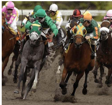
Milwaukee Appeal (right) leads Tasty Temptation (left) in Woodbine Oaks

The one-two finishers of the Woodbine Oaks two weeks ago-- Milwaukee Appeal (Milwaukee Brew) and Tasty Temptation (Medaglia d'Oro)--are set to take on the boys in today's marquee event. Both earned higher speed figures in that June 7 affair ( video ) than any of